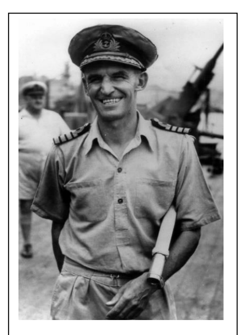
Commodore J.M. Armstrong

Armstrong (Reidel, Dordrecht, 1984), 3-54.