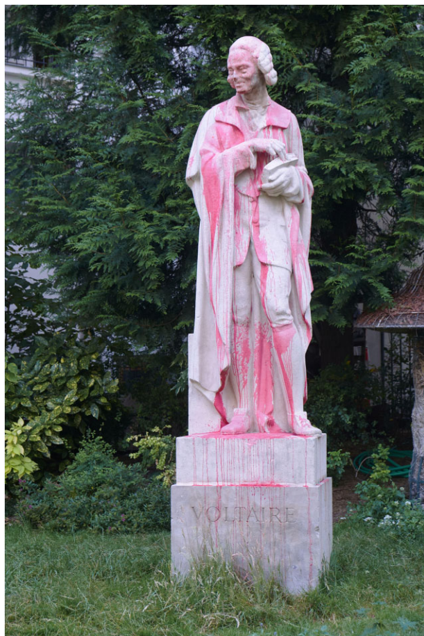
Statue of Voltaire, Saint-Germain-des-Prés, Paris.