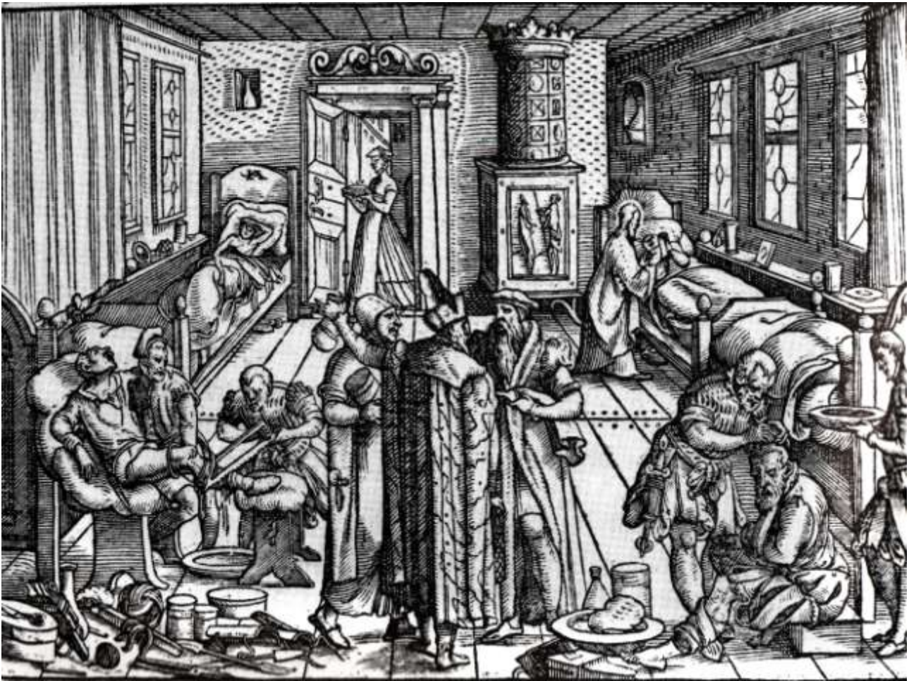
Frontispiece, Opus Chirurgicum by Paracelsus (printed in 1565, Frankfurt).

astrology and alchemy, has alienated the philosophy of nature, which once allowed to doctor to realize that everything is related to everything, and that science alone cannot provide any explanation to every question, without any regard of a monistic vision both of man and of universe. Contrary to the ancients, who had to be talented in order to achieve the general truth, the modern doctors, gradually, have focused on some particular facts. This change in perspective has led to a transformation of themselves: in order to pursue science and technology achievements,