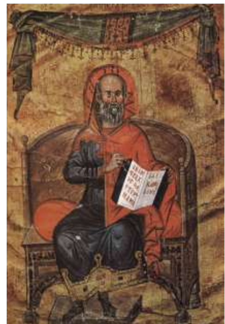
Previous page: Hippocrates, engraving by Peter Paul Rubens (1638). Below, from left: Hippocrates and Galen, painting in the crypt of Cathedral Anagni (first half of the twelfth century); Hippocrates painted by a Byzantine artist of the fourteenth century.