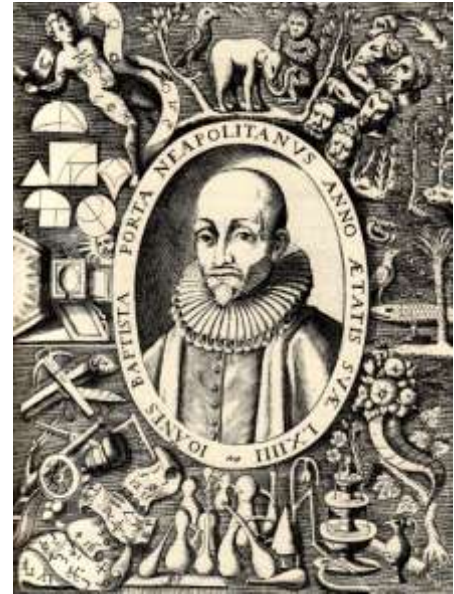
From left: Girolamo Cardano at the age of 49; Frontispiece, Contradicentium Medicorum Liber by Girolamo Cardano (Venice, Geronimo Scotto, 1545); Giovan Battista Della Porta at the age of 64 (picture of the seventeenth century).

have occurred whose terrible effects will affect the rising generation one day. If you consider the cycle of vicissitude in which individual survival is irrelevant, who the real fool? It would be better if we were tolerant of these precursors of the modern science, in any case they managed with science and alchemy. They weren't able to put the numerous applications of the experimental method into practice, because the reality was not revealing to them. It was difficult to achieve good results, as a consequence they turned to the medieval magic tradition. The magic was regarded by those wise men as the only mean at disposal to exploit the enormous potential of nature that was perceived by them as an active force in the Universe.