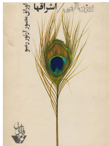
Figure 3: Cover for Bijan Elahi’s translation of Rimbaud’s Illuminations (1983).

Elahi is unique in terms of both the method and the means through which he introduces foreign poetry into Iranian literary modernism. His approach alienates the translation from its target language and foregrounds those aspects that appear to resist translation. While he experiments with different poetic forms, including many that are alien to his own poetic style,