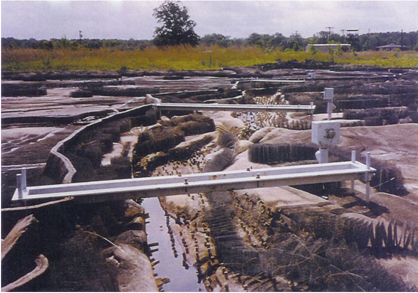
Fig. 1 The Mississippi River Basin Model

to flooding on the lower Mississippi (Robinson 1992). 2 A physical simulation of San Francisco Bay constructed in the 1950s and attempts to simulate the structure of levees and watercourses in New Orleans under the impact of Hurricane Katrina offer further examples of precisely this kind of isomorphism (Huggins and Schultz 1967, 1973, Interagency Performance Evaluation Task Force 2006). [Links to animations and further resources regarding many of the simulations referred to can be found at www.pgrim.org/hsf .]