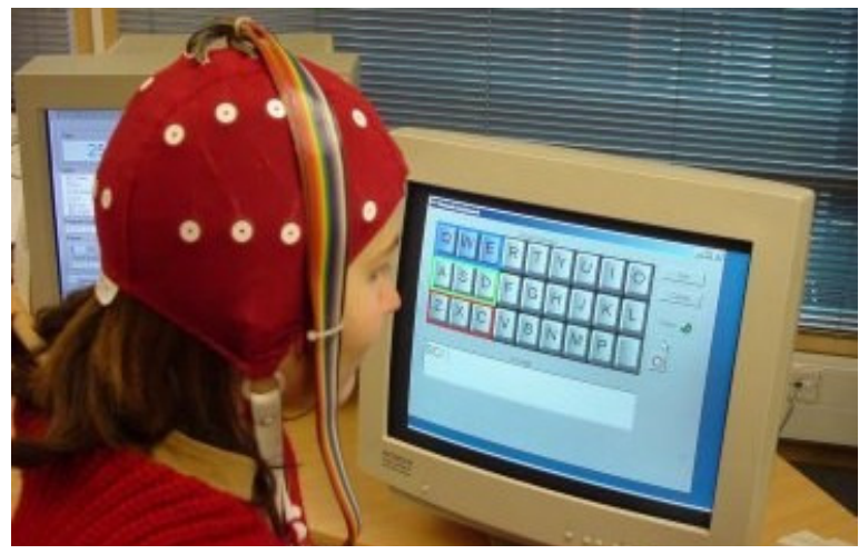
Figure 6. A person using a linguistic application.

We know that linguistic applications are cognitive artifacts that extend the communicative means of its user by enabling to select letters on a screen with a cursor. On the screen of a linguistic application, each letter of the alphabet is presented in the same size on the screen in qwerty style (Figure 6).