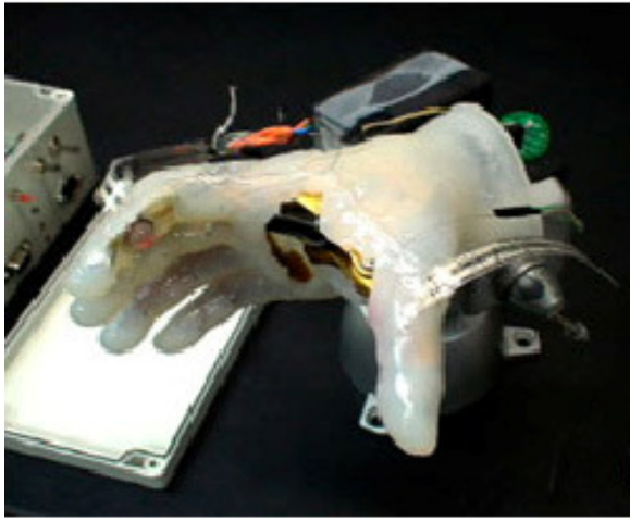
Figure 4. A BCI-controlled-hand-prosthesis.

At this point in time, using a BCI-controlled-wheelchair is possible. However, using a BCIcontrolled-prosthesis is still in an experimental stage (Hochberg et al., 2006). It is important to note that controlling a motorized wheelchair or prosthesis by means of a BCI is done by imagining certain movements, for example, by imagining to move the right arm to the left or to the right.