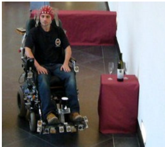
Figure 3. A BCI-controlled-wheelchair.

The BCI itself consist of the electrodes and signal processing unit, which are used to steer a particular application like, for example, a motorized wheelchair, prosthesis, spelling device or computer game. Although the applications are diverse and used for both healthy and disabled subjects, BCIs are mainly developed for persons who have disabilities in motor function and communication. Disabilities in motor function can be partly restored by using a BCI to steer a motorized wheelchair or a prosthesis (Figures 3 and 4).