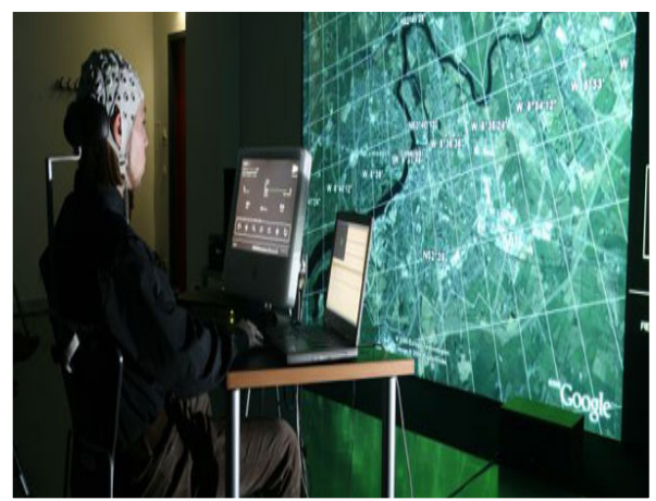
Figure 6 . A person using a BCI based on visually evoked potentials to control Google Earth.

Another example of an application for healthy subjects is using Google Earth with a BCI (Figure 6). Google Earth can be controlled by visually evoked potentials. In the above figure you see a person who is using a BCI based on visually evoked potentials to control Google Earth. On the computer screen in the left of the picture the command signals like 'go to right', 'go to left' or 'zoom in' are presented. Each command signal lights up and when the participant looks at it, it induces the P300 potential, which is causally linked to the application.