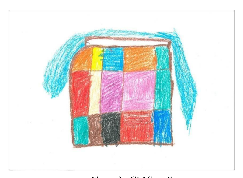
Figure 3 – Girl Somalia

The theme of Sport as a spectator has connections to global sport, but as something that others are doing. This theme was only represented by girls who cannot participate in sports and are aware of that proscription. They cannot present themselves in the limited clothing worn by most girls participating in sports. In these drawings, a girl's opportunities to experience the life-world of sports is limited; to avoid participation, or explain the lack of it, they refer to an injury or sickness.