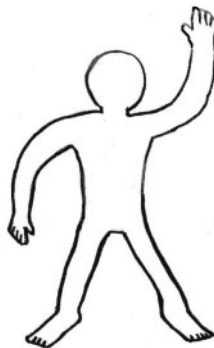
Figure 1: Template for the drawing of language portraits

In recent years, the research group at the University of Vienna has collected and evaluated several hundred of these multimodal language portraits in the context of various projects. It is of course true that the metalinguistic commentaries of speakers and the visual and verbal representations of their repertoires, which emerge during the research process are representations produced in a specific interactional situation. We do not consider them an image of the linguistic repertoire 'the way it really is', nor as an 'objective' reconstruction of the history of language acquisition. Selection, interpretation, and evaluation take place in the visual mode as much as in the verbal mode, and representation and reconstruction do not occur independently of social discourses. With this acknowledgement, in the following section, I single out one of these portraits and submit it to a close reading to show what this approach has to offer in terms of exploring linguistic repertoires.