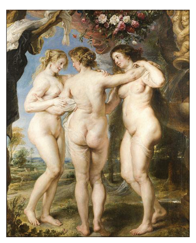
Figure 4: The three graces (c.1635), Rubens