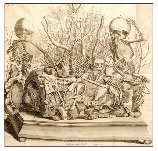
Figure 1: Van Fredrik Ruysch. Alle de ontleed - genees - en heelkindige werken. Vol. 3. Amsterdam, 1744. Etching with engraving, Frederick Ruysch.<sup>[5]</sup>

Iranian actress and artist Mania Akbari, who was diagnosed with breast cancer, directed the film 10+2 that depicted her struggle with the disease, which caused her to lose her breasts. Her mutilated and marked body was the center of many following works among which were a photographic series titled Devastation (2008) and the video project " In my country men do have breasts " through which she tries to draw lines in between her personal catastrophe and the sociopolitical situation in Iran, Israel, and the war in the Middle East. The video captures the essence of prosthetic memory in a landscape of war and in the landscape of a damaged body. In mid-90's,