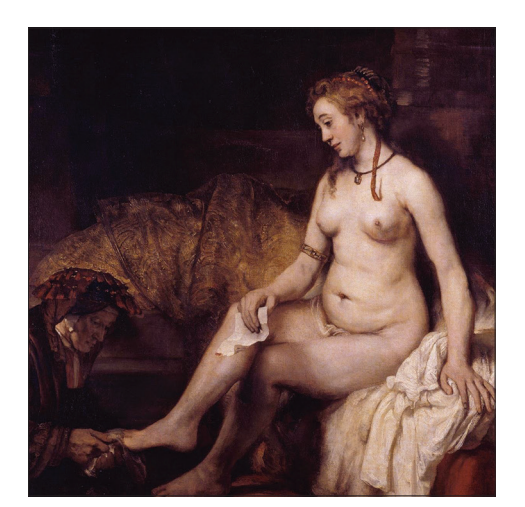
Figure 3: Bathsheba at her bath (1654), Rembrandt.<sup>[6]</sup>