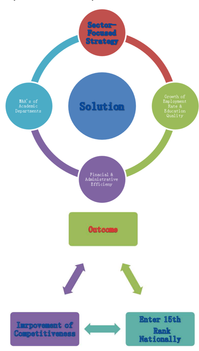
Figure 3. Strategic Goals and Issues of V2020

has been serious over the months since the plan includes a loss or injuries for the merged departments. Therefore, the plan was pushed carefully to persuade the aggrieved professors and staffs, as well as pursued in open context of free debate or mobilization of firm agreement. Overcoming the controversies and complaints from several groups, the plan had been finally adopted by the Chancellor with the advice of the Commission of Academic Affairs (CAA), and soon after, the Board of CU approved the plan in this May. Let me brief the final form of strategic plan and create the vision for the future. The use of diagram can facilitate a more effective communication with the leadership and followers.