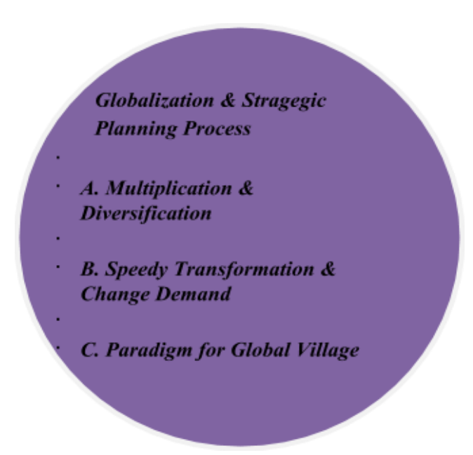
Figure 2. Globalization and strategic planning process, part 1

The globalization and free trade are necessarily associated with the hawk eyes of capitalists that the skills and technology, capitals are fast imported and shared (Glover, 2004). This generally incurs a high speed of societal transformation and the change demand brings a crucial role of strategic process to survive and improve the organizational performance. Even for the consumers like us, this phenomenon is palpable and demanding to change. So suppose how it would be serious and consequential for the organizations let to compete and struggle. This increasing pressure can be viewed to make the strategic mind and practice indispensable and rampant across the individual and organizations (U.S. Small Business Administration, 2013). This point also influences the mode of strategic planning process since the communication and exchange of ideas are facilitated and instant (Glover, 2004). Now a video conference is a normal way to manage the multinational corporations, and valuable information can be transmitted easily and frequently. The time to turn on the strategic change cycle would be shortened, and any more frequent context of top leadership can be practiced. "Planning other than plan" as adverted by Eisenhower would now truly be realizable.