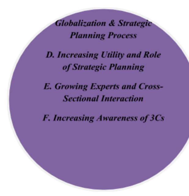
Figure 3. Globalization and strategic planning process, part 2

The role of three Cs in the strategic planning process would be impacted by the globalization. The scale of three Cs, among others, tend to get expansive and came to be internationally required of reshaping a traditional understanding concerning their dynamism and zone of operation (Korukonda, 2006). Now the contemporary organizations, as we see in the case of Coca cola, have to respond to the diversified context of global management. The strategies and tactics may well differ to address a local traits and market demand. The Hong Kong branch of Coca cola would not exactly be same with the US domestic headquarters or market in terms of sales increase strategies. The globalization also contributes to the diversity of workforce. A multiculturalism or support of disabled in the workplace and disadvantaged female cadre in the context of promotion would be a most notable issue that the global enterprises are stumbled with the new concept and requirements (Novitski, 2008). Global organizations engaging in the joint venture agreement are prone to interact with the government of host countries. They are now required to comply with the Code of Conduct enacted by the UN General Assembly. This kind of norms likely operates to shape a proper form of collaboration, cooperation, and coordination. Hence, one impact would be that a multiplicity of norms and authority should be present to interplay with the organizations and affect the traditional pattern of 3 Cs (Owusu-Ansah, 2014).