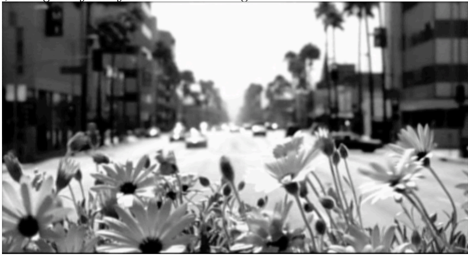
Street and daisies

The story does not end there, however. It might seem as though Kaufman has succeeded in adapting The Orchid Thief in a perversely appropriate manner—indeed far more faithfully, in a sense, than if he had simply rewritten its events for the screen—but failed at the much more important task of making a movie about flowers. (Let's be honest, Adaptation is about as much about flowers as Flowers for Algernon is about flowers. 24 ) Recall, however, that Adaptation closes with a time-lapse sequence of daisies on a meridian, an astonishingly powerful sequence, with rhythms borrowed (appropriately enough) from the Fibonacci series 25 and set to music that ends in a lush, ethereal harmony. What if this sequence were not just the finale but also the telos of the movie? 26 What if the entire film were simply building up to the daisies on the meridian, indeed making them possible, turning them for the first time into something that can be noticed? 27