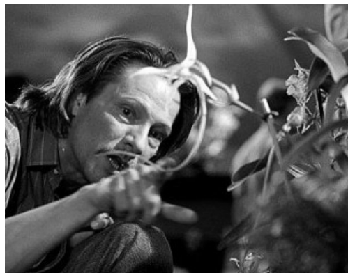
“Darwin hypothesized a moth”