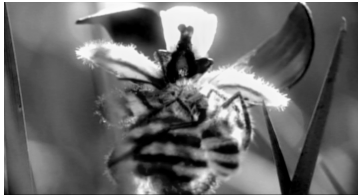
“Its double. Its soul-mate.”