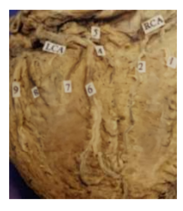
Fig.-4: Posterior Interventricular artery arose from both right (No 2) and left (No 6) coronary artery casing balanced dominance.