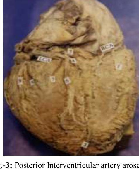
Fig.-3: Posterior Interventricular artery arose from left coronary artery (No 6) casing left dominance.