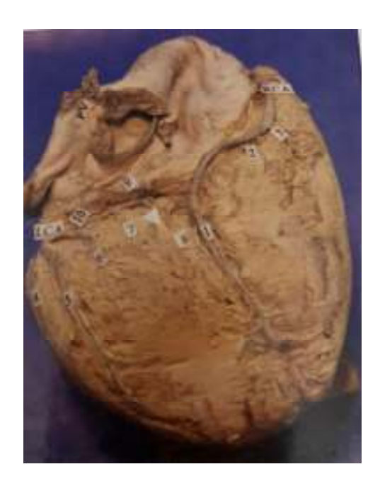
Fig.-2: Posterior Interventricular artery arose from right coronary artery (No 1) casing right dominance.