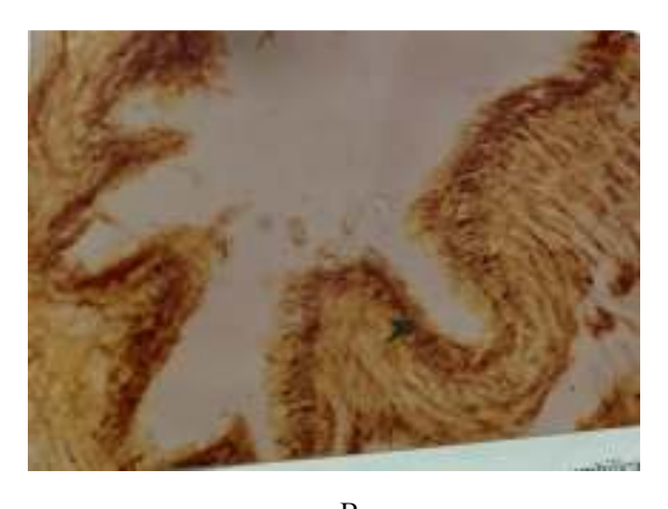
Fig 2. A Umbilical vein without internal elastic