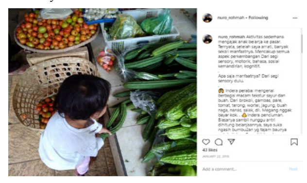
Figure 7. Doing Simple Activities to Children's Abilities Development

physical balance. I also share things that have already been experienced or done by themselves because there is more like that". Furthermore, Figure 7 shows the sharenting conducted by participants by carrying out daily activities in the form of buying goods in traditional markets. The sharenting activities shown in Figure 7 below have the aim to improve children's cognitive and psychomotor development, as well as increase social sensitivity in children.