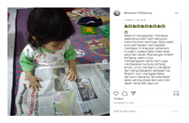
Figure 2. Sharenting by Reading Books Posted on Instagram

Among the examples of sharenting that have an impact on parents' cognitive are first, sharenting with educational content fosters a love of books and reading. As AF did on her social media account. Several posts share AF activities holding reading material, or photos of books that are given review comments. The post contains education to foster children's love of books and reading. As in one of her posts, AF wrote, "Before teaching reading, actually we are more aimed at fostering the love of SA in books and reading. Therefore, this reading activity is carried out as interesting as possible so that the SA does not go away quickly and get bored. It can be attractively tale, read aloud, read out We also read books about emotions to help identify and express their feelings". Furthermore, Figure 2 shows the Sharenting conducted by the participants by conducting education to foster a love for books.