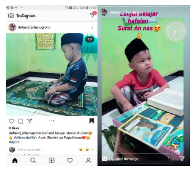
Figure 9. Sharenting Habit of Islamic Worship and Education