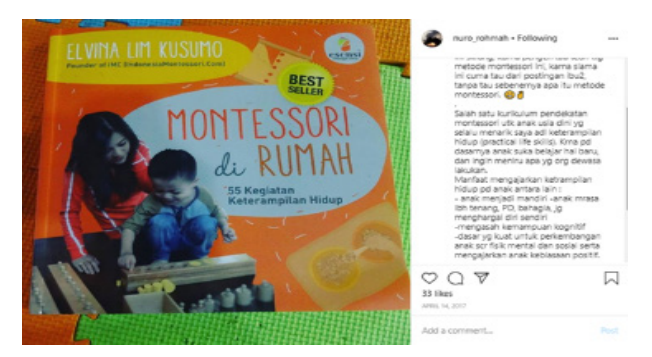
Figure 6. Sharenting by Creating Child Growth

knowledge/insight practices about parenting that they just get after seeing or knowing from sharenting that other people do. The attitude of parents towards children will change according to the intellectual ability of parents from the results of cognitive development [34]. Among the effects on parental attitudes on children are sharenting about child development and education, morals, and increasing parental religiosity. Sharenting about education can grow and develop children's potential [35,36]. The content of education about child development is also a content of sharenting by millennial parents. Discussions about children's growth and development are much discussed by parents and have an impact on changing attitudes of parents to children. In sharing what they do, they share knowledge about the way they do parenting by paying attention to the child's growth and development. Figure 6 shows the Sharenting conducted by the participants by growing and developing children's potential.