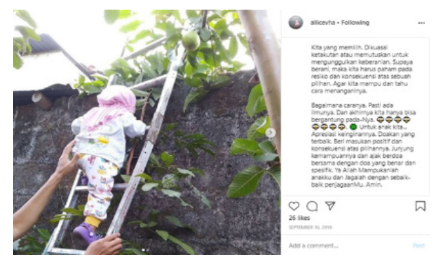
Figure 8. Teaching Simple Activities to Train Children Mentally

Meanwhile, parents have a different perspective and attitude about responding to their children who are climbing. Sometimes some parents forbid their children to climb because they are worried that it will endanger the child, and say the word prohibition that can kill the child's development potential. These events can be shown in Figure 8 below. Figure 8 shows the sharenting done by the participants by teaching children to climb trees to train the children's courage and mentality.