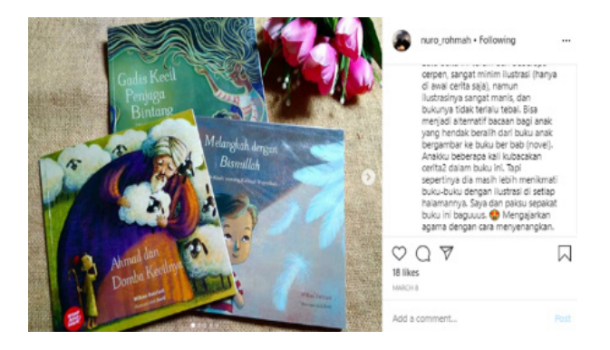
Figure 3. Sharenting by Invites Children go to The Library

reading, learning to read is not a burden for children, but rather something that is considered fun. Similar to AF, sharenting conducted by NR also contains educational content about growing love for children's books and readings. Related to the impact of sharenting on parents' cognitive that is done by NR who often invites children to go to the library, NR also shares photos of books that she recommends to read with children so that children have a love of books. Furthermore, Figure 3 shows the Sharenting conducted by the participants by invited children to go to the library and sharing photos about books that can be read with children.