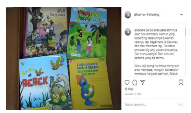
Figure 4. Sharenting by Creating Reading Interest in Children

social media account. In one of the posts on Instagram AF shared a photo of the book by providing information on educational writing to foster children's anger. Figure 4 shows the Sharenting conducted by the participants by invited children to go to the library and sharing photos about books that can be read with children.