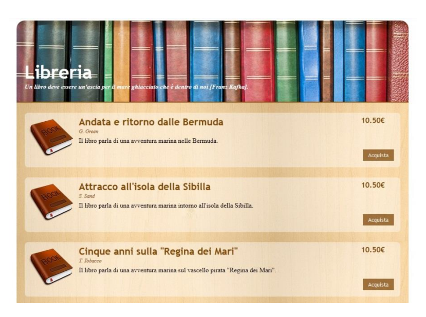
Figure 3. A screenshot of the non-persuasive version of the online bookshop website.

Having decided to carry out our experiment in the context of an online bookshop, we prepared some basic information to present ten imaginary books belonging to the same genre, seafaring adventures: the title, the name of the author and a short description. All information was made up and we paid attention that it followed a similar format for all the books, in order to limit the number of factors which might influence participants' choices. For example, we had a book entitled "Docking at Sibyl Island (Attracco all'Isola della Sibilla)", written by the imaginary author "S. Sand", with the following short description: "This book deals with a seafaring adventure on Sibyl Island". Moreover, all books had the same price (10.50 €).