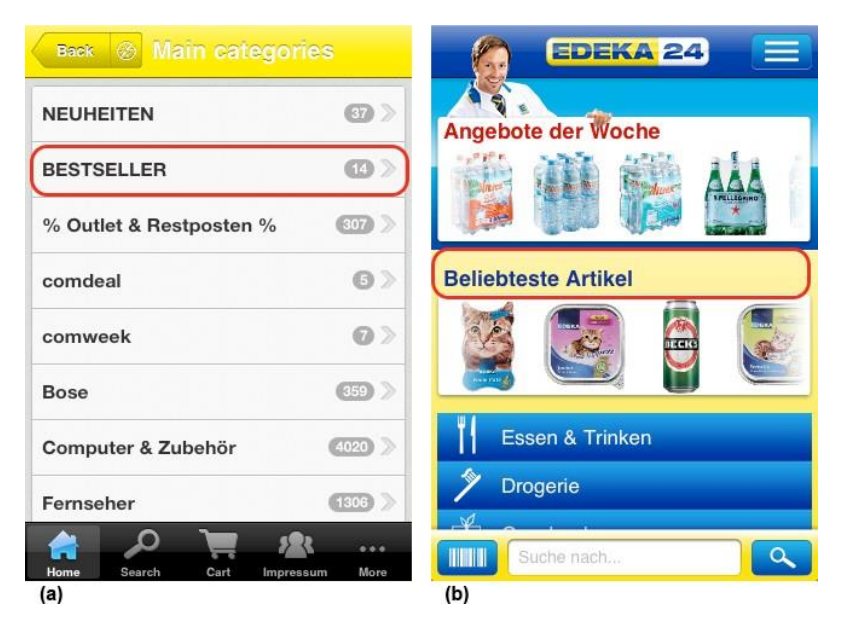
Figure 1. An example of the arg. ad populum fallacy in Comtech.de (a) and Edeka 24 (b).

on 101 mobile apps and 175 websites in the e-commerce domain<sup>4</sup>. In fact, we surmised that technologies with a clear persuasive goal (i.e., selling goods) should make an extensive use of persuasive techniques.