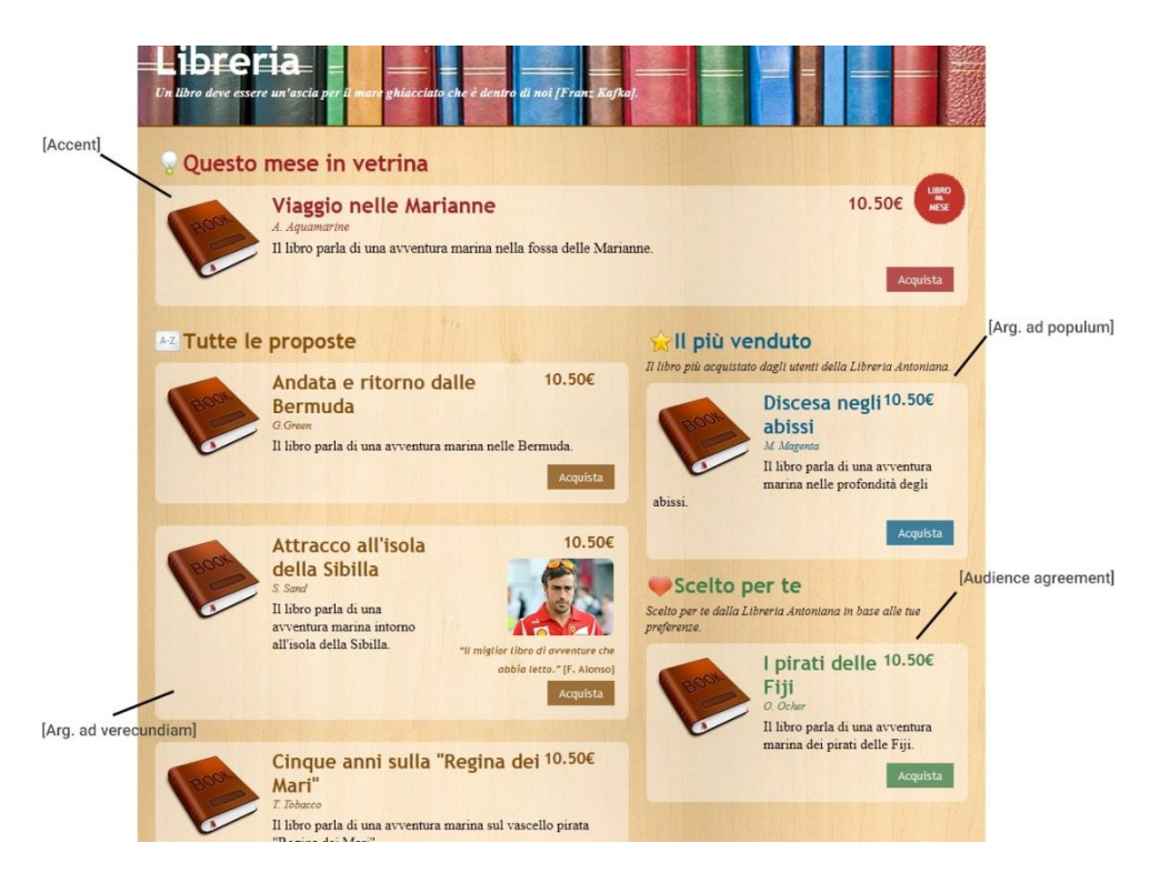
Figure 4. A screenshot of the persuasive version of the online bookshop website (fallacious persuasion strategies are highlighted).

The book to present as a personalized suggestion (audience agreement) was selected according to the similarity of its title to that of the classic chosen by a certain participant in the intro page, while the books connected to the other three fallacies were chosen at random for each participant. The remaining six books were simply presented in alphabetical order, in the left-side column.