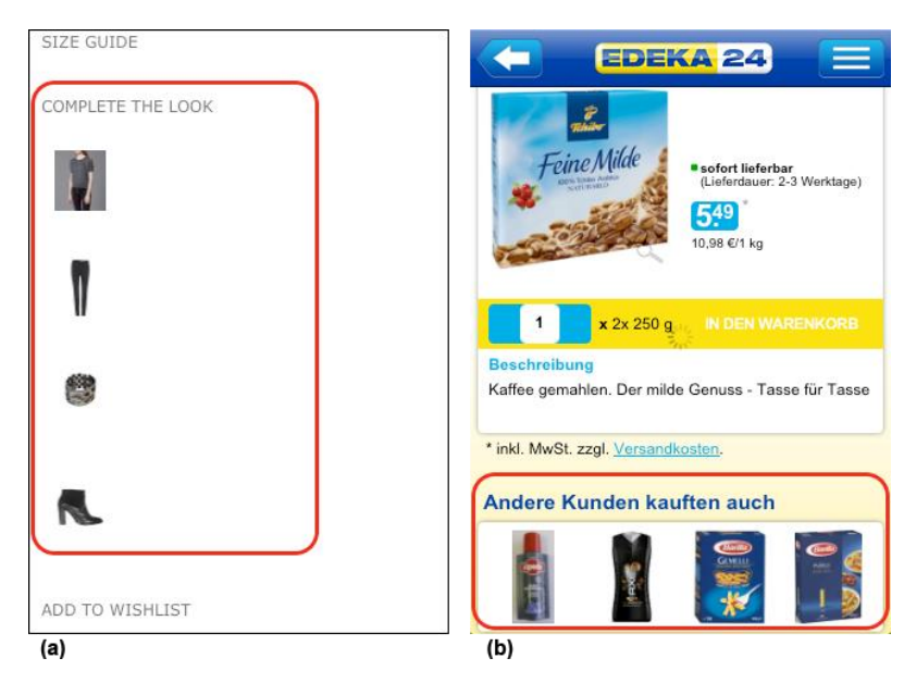
Figure 2. An example of the audience agreement fallacy in AllSaints, (a, content-based suggestion) and Edeka 24 (b, collaborative-filtering-based suggestions).

the use of recommendation techniques (see Figure 2). Finally, the argumentum ad consequentiam has been associated to the presence of software environments which are able to simulate the consequences of certain user choices, and the accent fallacy to the case when part of the purchasing-related information is emphasized and part is hidden (e.g. when shipping or tax costs are presented only at the end of the purchasing process, or when certain products are given more visual prominence than others).