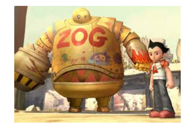
Figure 4. ZOG (Astroboy, 2009)

Another example of light eyes can be sweeper robots in WALL-E (2008), that light board shows the eyes' current form.