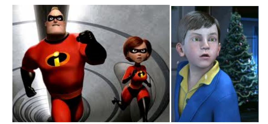
Figure 2. Incredible in contrast with The Polar Express, as it is seen the uncanny valley is more sensed in The Polar Express with more realistic characters than in Incredible.