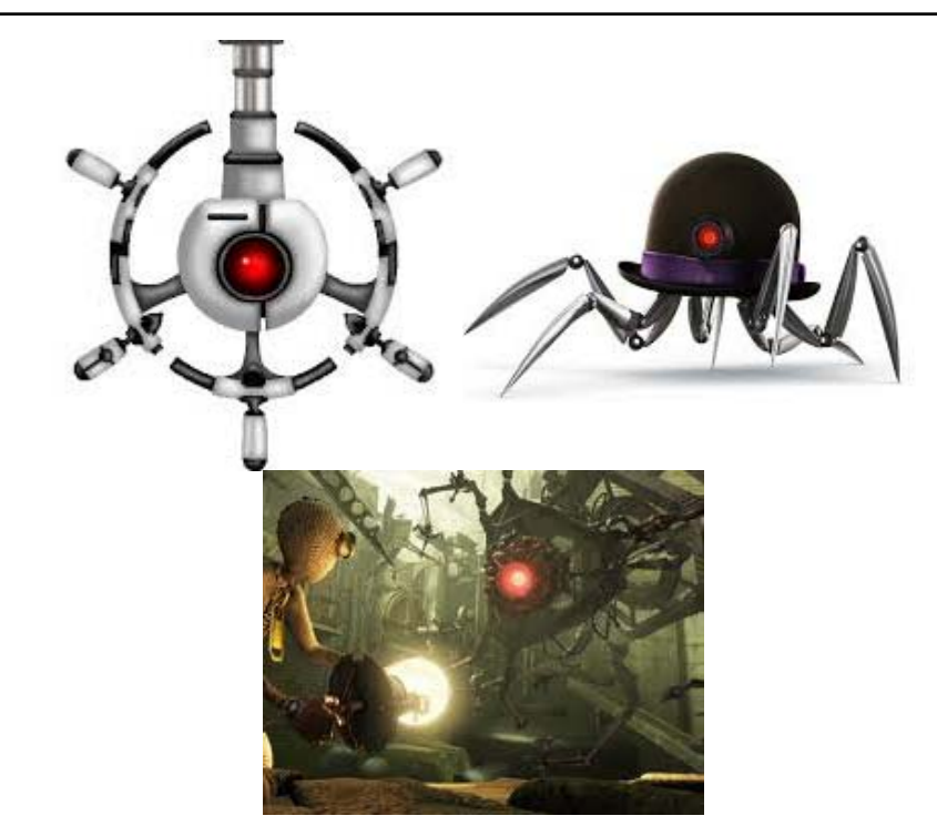
Figure 8: Auto (WALL.E, 2008) Figure 9: hat (Meet the Robinsons, 2007) Figure 10: robot (9, 2009)