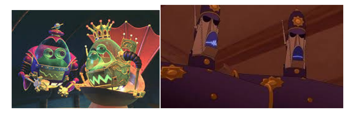
Figure 12: space creatures ( Jimmy Neutron , 2001) Figure 13: robots ( Treasure planet , 2002)

The lips of extraterrestrial characters in Jimmy Neutron: Boy Genius (2001) and also the two robots who arrest Jim Hawkins in Treasure planet (2002), have display board as their mouth, but since they are not designed to be good characters the Display board just show sound waves.