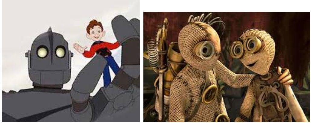
Figure 5. Iron Giant (Iron Giant, 1995)

Many robots in animations have two cylinders as their eyes. Iron Giant (1999), 9 (2009), Meet the Robinsons (2007), Treasure Planet (2002), Robots (2005) are examples of these animations. Using telescopic eyes give lower view angle to the visitors to diagnose the robots current eyes' form, so it can be a good trick to just concentrate on implementation of they appear in frontal view. The characters mentioned all has lower and upper lids or spiral lids to cover some parts of eyes and give emotions to them. Characters Eyes in 9 (2009) has dark circle inside as iris but in Iron Giant (1995) the robot has no iris but when it is needed to show the direction of look, two center lights in the eyes move to corners of the circles of eyes.