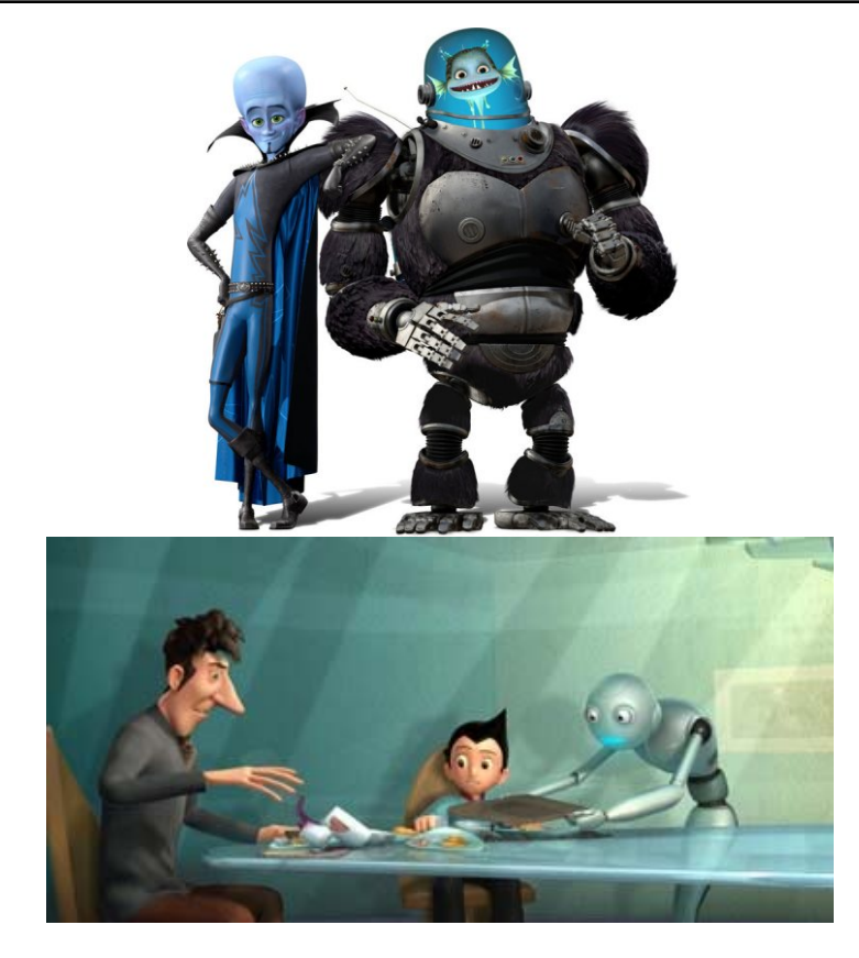
Figure 14: minion (Megamind, 2010)