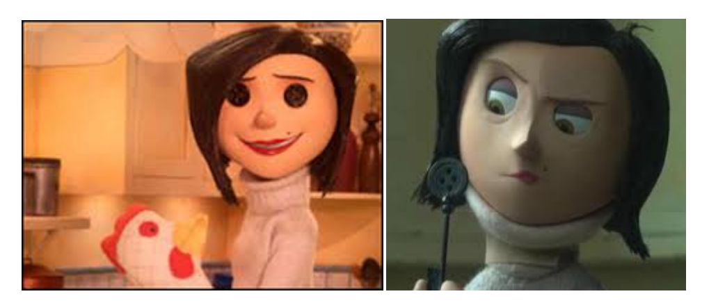
Figure 11: button Eye mother vs real mother (Coraline, 2009)