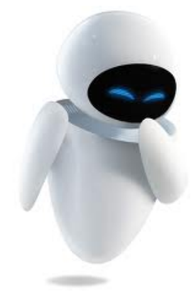
Figure 3. Eva (WALL.E, 2008)

When the size of robot increases and we get less involved in its facial emotions, just two circles or just two light points are used, for example in Astroboy (2009) there is a robot that has just two shining circles as its eyes and ZOG, a friendly robot with a large body and very small head has just two spheres as its eyes.