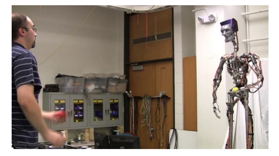
Figure 1: The juggling robot

Russel and Norvig utter four possible goals to pursue in artificial intelligence: 1) Systems that think like humans. 2) Systems that think rationally. 3) Systems that act like humans 4) Systems that act rationally [2]. To make a humanoid robot may not necessary mean to make a perfect and realistic robot: perfect in acts perfect in face, and perfect in emotional faces. Not being perfect makes it more possible to be different among others and that is what exists between human beings and forms the difference, characteristics and identity. Some features can be defined, and point is to decrease and increase some features in different robots to give them identity and make them more accepted by people. Although the shape and mechanics of motion is a matter but more is the acts and reactions.