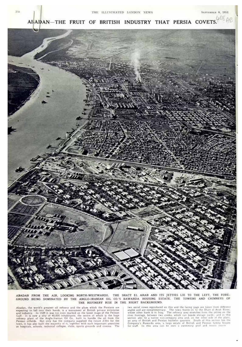
A 1950s British newspaper describes Abadan as 'a monument of British enterprise and industry' (September 8, 1951). Illustrated London News

For Malaysia, it's a question that has already been asked regarding palm oil and deforestation. Environmental activists in the country and abroad have highlighted their negative impact, which resulted in poor publicity for the country. However, through government engagement with youth and activists, there has been some improvement with how palm oil is viewed especially with regards to sustainability efforts.