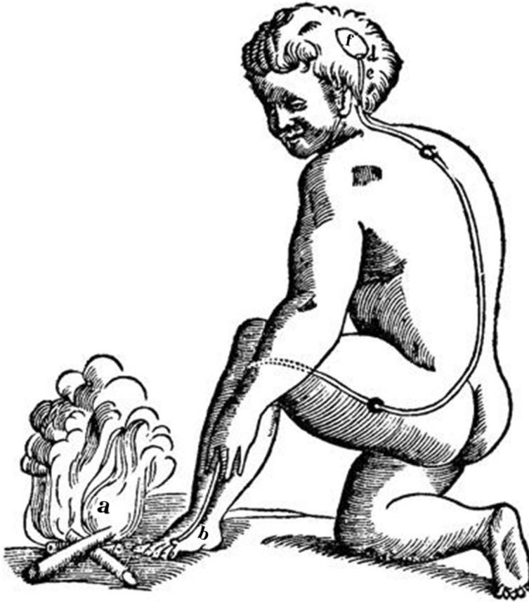
Fig. 1 The reflex arc of pain according to Descartes. The fire ( a ) is a stimulus afflicting the skin ( b ) and moving the fine thread ( c ), which goes to valves ( d, e ). The valves open the cavity ( f ), from which an animal spirit is released, which in turn makes the head turn and move the hand and the foot

nervous system: take in the incoming input, sensory information, and get the output, motor behavior. How could it be otherwise?