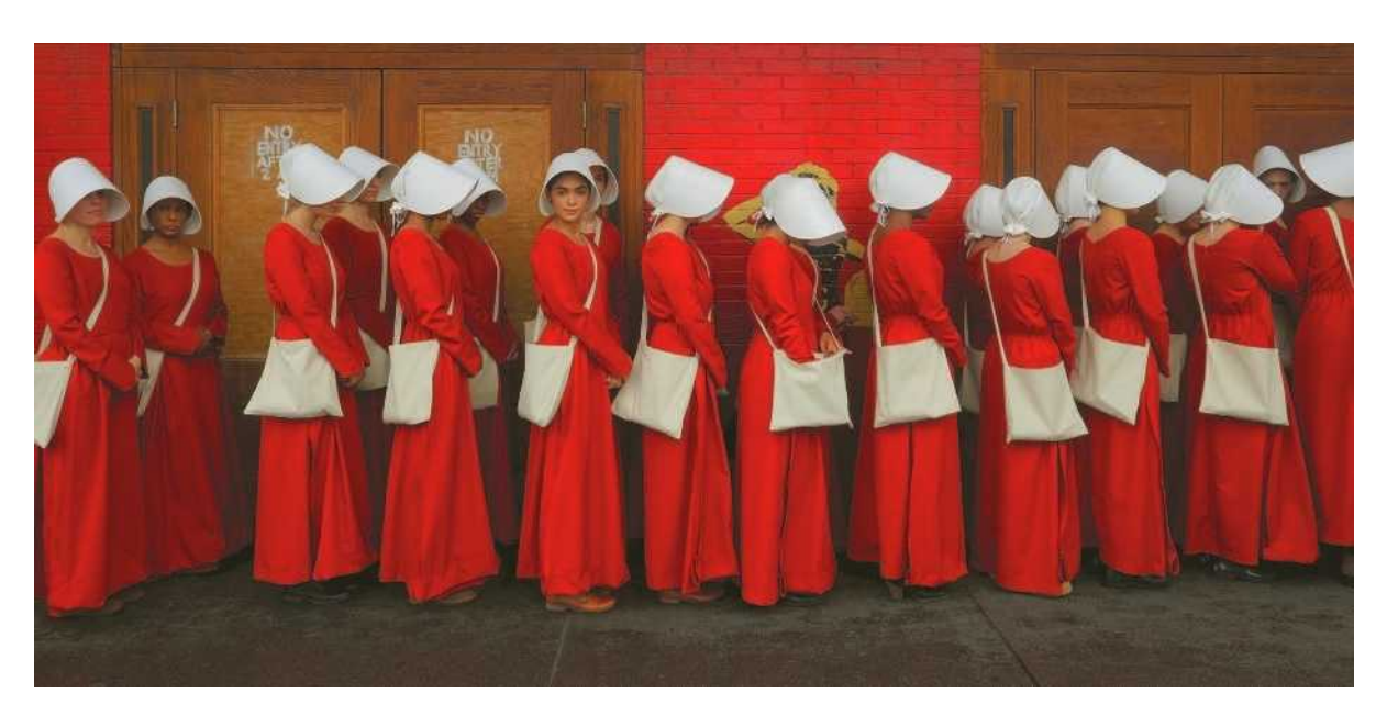
A promotion for the Hulu series based on Margaret Atwood's novel The Handmaid's Tale. The novel's narrator says the bonnets the handmaids wear "are to keep us from seeing, but also from being seen."

Imagine a world in which women are forbidden from holding property or jobs and even from reading. In this world, women are taught that the order of things entails their utter subservience to men. It is a world in which women's freedom is so circumscribed that they are forced to bear children against their will. This is the world that Margaret Atwood (1939–) portrays in The Handmaid's Tale (1985), a novel set in the Republic of Gilead, a repressive theocracy that takes hold in the United States after a governmental coup. This is a world in which women's oppression—and their reduction to nothing more than their reproductive function—is complete. In Gilead, rich, White, able-bodied men determine the meaning and shape of all women's lives. They do so in large part by controlling the