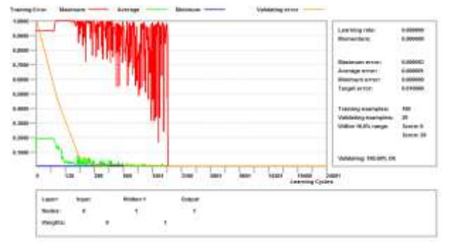
Figure 2: Shows the Training, error, and validation of the data set.