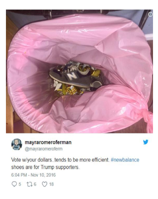
Figure 2: Image posted online with New Balance shoes thrown to garbage by anti-Trump customers

"In the wake of the deeply divisive US presidential elections, brands were wise to keep out. But New Balance was accidentally drawn in. Anti-Trump websites misquoted a New Balance spokesperson saying Obama had let them down and with Trump 'things are going to move in the right direction'. While the spokesperson was referring to the Trans-Pacific Partnership only, the internet seized the quote and repackaged the message: New Balance offers a wholesale endorsement of the Trump revolution . It led to alt-right groups praising it as a brand for white Americans, while anti-Trump groups burning their New Balance shoes and sharing the ritual online."