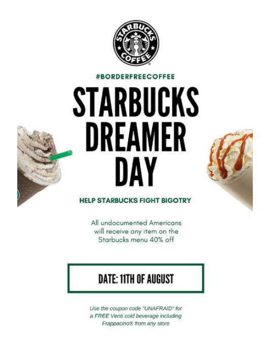
Figure 3: Fake news spread in social media about Starbucks "Dreamer Day"

"Advertisements including the company's logo, signature font and pictures of its drinks were circulated with the hashtag '#borderfreecoffee'. But it was a hoax . Starbucks raced to deny the event, replying to individuals on Twitter that it was 'completely false' and that people had been 'completely misinformed'. Yet the rapid spread of the fake news showed again the power of social platforms to damage reputations, and illustrated how companies should be more vigilant and creative in responding." <sup>10</sup>