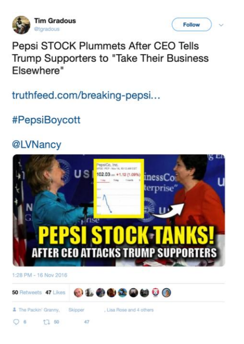
Figure 1: Fake news spread on Twitter about Pepsi Co CEO Indra Nooyi statement8

jumped on the fictitious quote, with people threatening to boycott all of Pepsi's brands using the hashtags #boycottPepsi and #Pepsiboycott."<sup>7</sup>