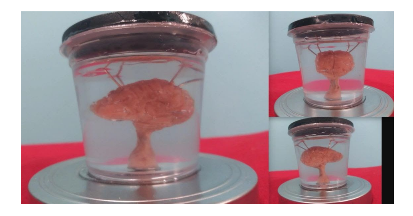
Figure 5 Brain in a Vat Resin and Clay Sculpture by M. A. Parks. 2021.

PIT proponents sometimes appeal to thought experiments that involve a brain in a vat. Such brains are supposed to be physically identical to some actual brain, with identical inputs resulting in an allegedly identical intentional experience. PIT proponents argue that the identical intentional states would occur because the brain would have a phenomenally identical experience to its actual counterpart (see Horgan, Tienson, and Graham 2004). Opponents disagree.