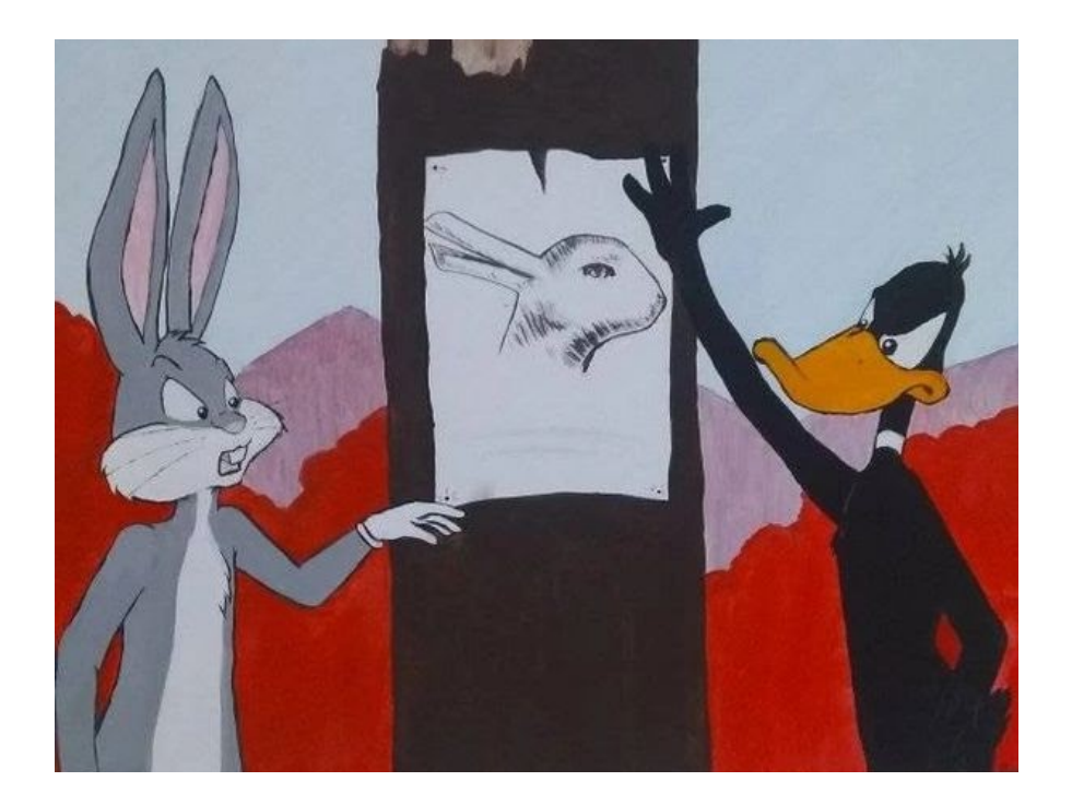
Figure 1 Duck-Rabbit Season by M. A. Parks. 2018. Characters property of Warner Bros.

Appendix 1: Duck-Rabbit Image, Phenomenal Character Affected by Concepts