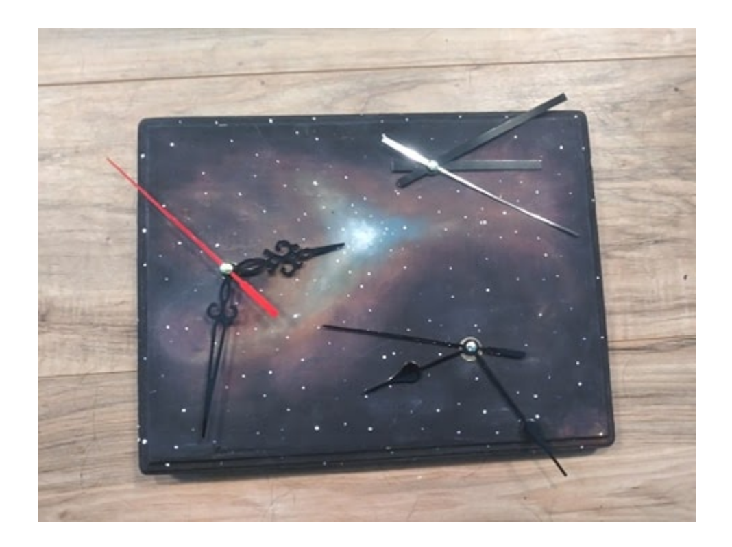
Figure 4 Spacetime by M. A. Parks. 2020.

It is not obvious that "time is actually [or metaphysically] a certain way" is the best explanation for time appearing to be a certain way to humans—it might instead be a result of human perception, which may not track the way time actually (or metaphysically) is. Similarly, the way the relationship between phenomenal character and thought seems to humans may not track the actual nature of the relationship between them; instead, this appearance may merely be the result of human perception. It is not obvious that one explanation is better than the other.