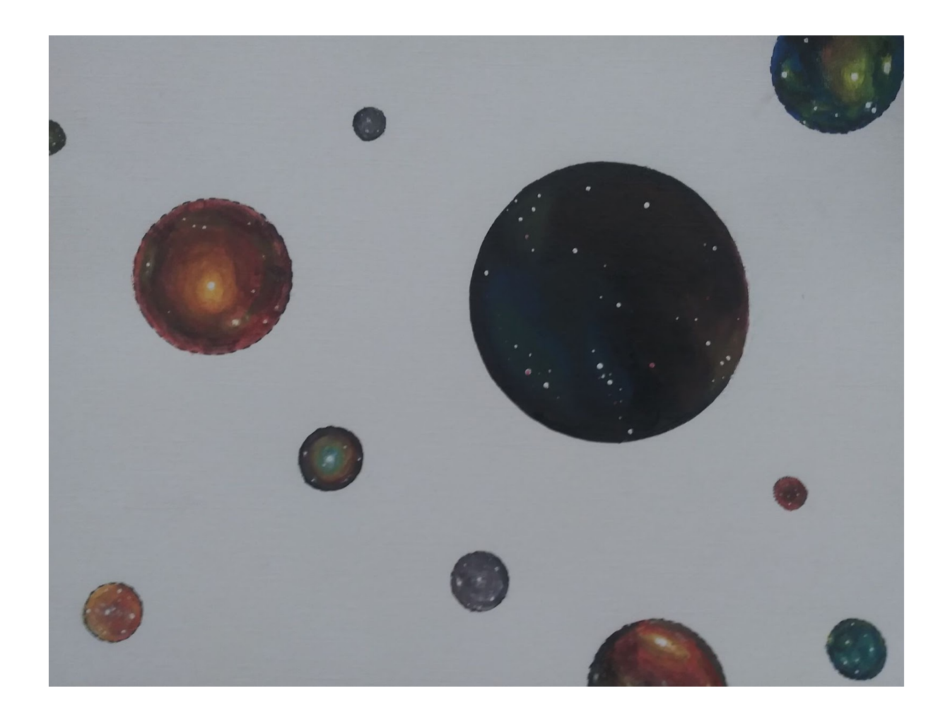
Figure 3 Metaphysical Necessity by M. A. Parks. 2020.

If Proposition A is metaphysically necessary, then A is true in every metaphysically possible world (including the actual world). In the image, each of the circles is intended to represent a different metaphysically possible world (but not all metaphysically possible worlds).