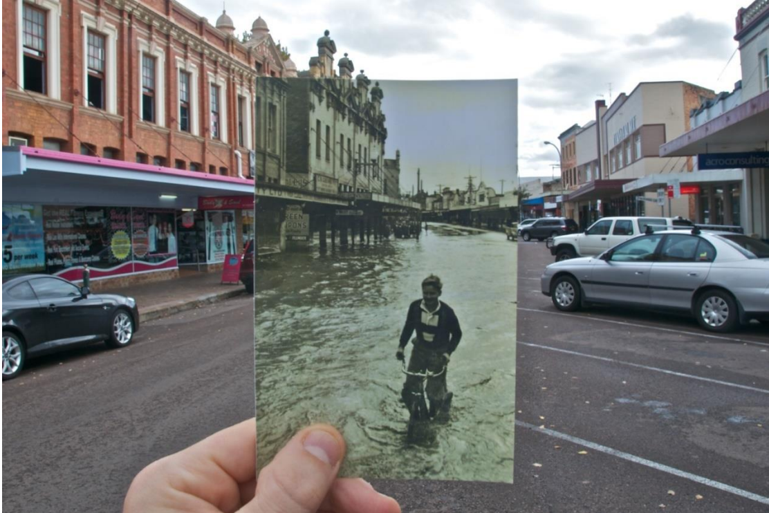
Figure 2. 'Looking into the past - take 2'. Example of rephotography. Original photograph of flooding on the High Street, Maitland, NSW taken in 1955, second photograph of same high street, taken 2010.