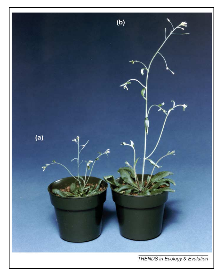
Figure 1. An example of phenotypic plasticity: the same genotype of the weed Arabidopsis thaliana exposed to mechanical stimulation (a) or lack thereof (b). Plasticity to mechanical stimulation (thigmomorphogenesis) can be an adaptive response to wind, precipitation, and/or attacks by insects. Reproduced with permission from Janet Braam and [39].

Even a superficial glance at the relevant literature will show hundreds of studies [1,7] reporting the finding of gene-by-environment interactions (GxE; i.e. genetic variation for plasticity), in a variety of organisms (Box 1, Figure I). Indeed, it is clear that, as a general question, this is one that has been answered: there is genetic variation in nature for plastic responses. It is now a matter of documenting specific cases of interest, when