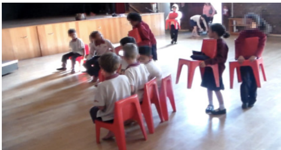
Figure 1. Walking into the hall with their chairs to create a circle

The school hall being entered was built with exposed brick work, it has an approximately 5 metre-high double volume ceiling. There are huge windows about a metre from the ceiling that, when seated on the floor of the hall, reveal the sky. The windows are so high that only the clouds, bugs and birds can look in. The floor of the hall is made of suspended wooden strip flooring. The raised stage is mainly used when school plays are performed or for art exhibitions and musical performances. A massive grand piano stands in the corner; it is very old. The hall has an approximately 500 plus person capacity, and it is used regularly every Monday when all the children and teaching staff meet for Assembly. 3 The main entrance of the hall houses a foyer with bathrooms and there are doors at the stage end of the hall that each lead off to more bathrooms and change rooms.