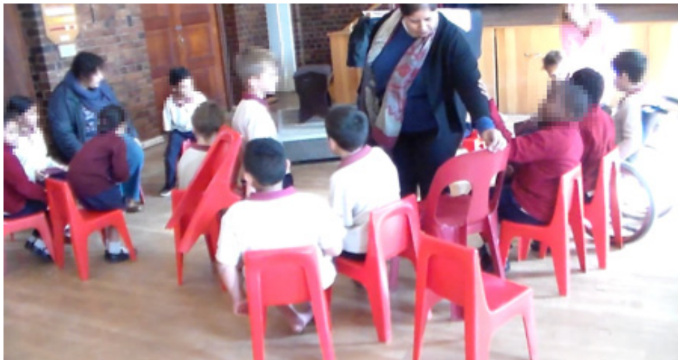
Figure 3. On touching