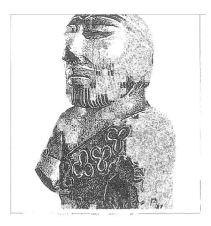
The 'Bronze Dancing Girl' (left) and 'Priest-King' (right).