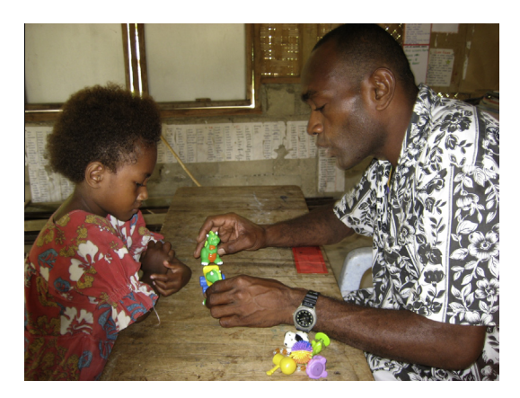
Fig. 1. Five-year-old being tested on the island of Motalava, Vanuatu.

Except in Vanuatu (see Section 2.7), all testing sessions were videotaped using a small Canon digital camera for later analysis and reliability assessment. The camera rested on a tripod three to five meters away and provided an overhead side view of child and experimenter, who faced each other at a table across a distance of one to two meters (see Fig. 1).