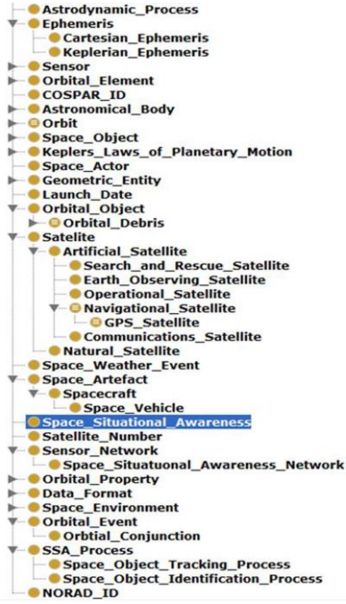
Figure 1: A preliminary taxonomy for the SSAO, displayed in Protégé.