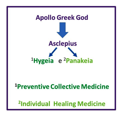
Figure 1. Relevant issues to consider the emergence of the concept of preventive medicine and curative medicine.