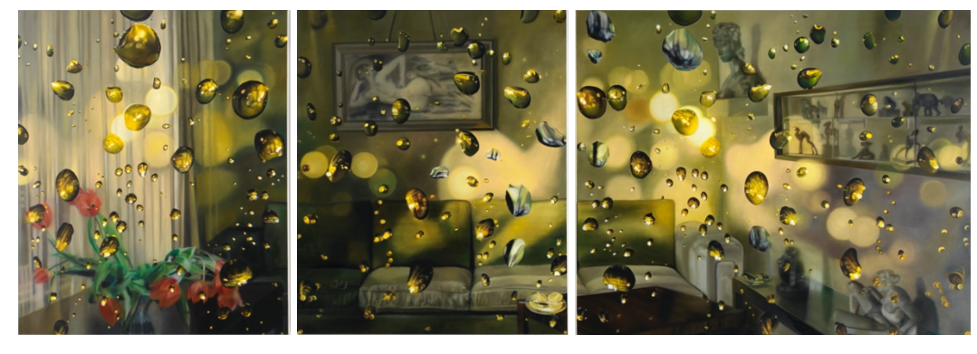
Figure 5: untitled (Haus Lange, Krefeld, living room), 2009, four-part, oil on canvas, 1,80 x 5,20 m, Collection Heinz und Marianne Ebers-Stiftung.

Kneffel's desire to reproduce everything as plausible and 'authentic' as possible, as it looked, inspired her to examine, especially with regard to the latter, who owns the works today and where they hang (fig. 7). (Voss 2019, 86) In this way, she can give a faithful picture of their appearance. With regard to Kneffel's realized Interiors, they seem to fulfil this claim so authentically, which they in turn do not.