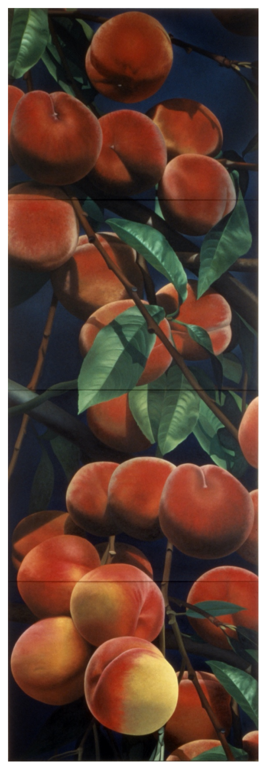
Figure 1: untitled (peaches,) 1996, four-part, oil on canvas, 7,10 \times 2,40m , KfW Stiftung Frankfurt a.M.