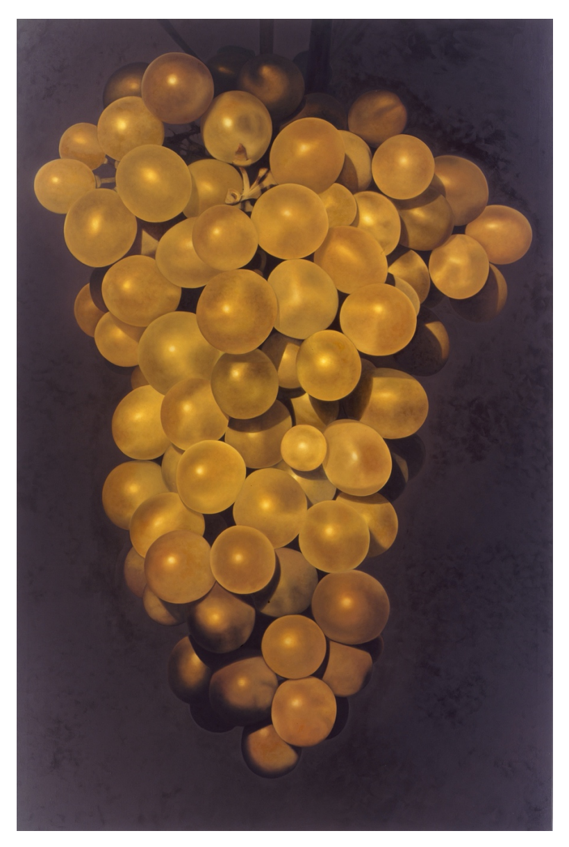
Figure 2: untitled (grapes), 1998, oil on canvas, 3,00 x 2,00 m, DZ Bank, Kunstsammlung Düsseldorf