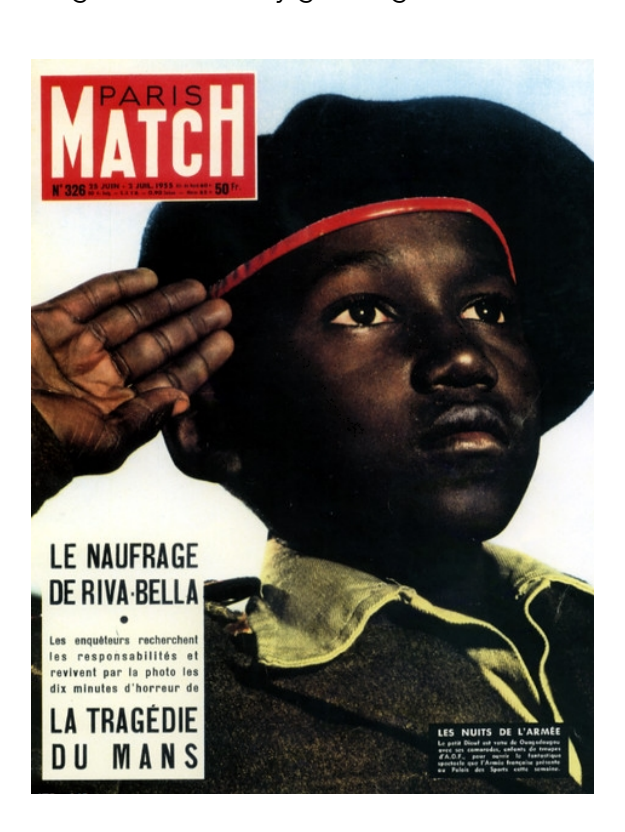
Figure 4: Cover, Paris Match , No. 326, 25th-26th June 1955 (https://en.wikipedia.org/wiki/Mythologies_(book), use Rationale for Roland Barthes "Mythologies", 1957

Roland Barthes is one of the first to make a significant contribution to the study of postmodern age, 'avant la lettre'. (Cf. re. cultural studies, Grabbe, Rupert-Kruse 2009, 21-31) In his key book Mythologies form 1957, he spoke of facts, which precisely characterizes the everyday understanding of media, be it words or pictures, without us recognizing their subliminal meaning. (Cf. re. images, Jöckel 2018, 255-273) The Fruits of Karin Kneffel are a good example of this. Influenced by our everyday experiences, they too give us credible impressions of fruits that look exactly the way we think they should look, be it peaches, grapes, apples, plums or cherries. But Roland Barthes abandoned this idea by showing that what we see is never factual or neutral, but "mythologies". One of the best-known examples, with which he also presented his theoretical considerations on the subject, is the cover of the magazine Paris Match from June 1955 of a young black man in uniform saluting with a militarily greeting.