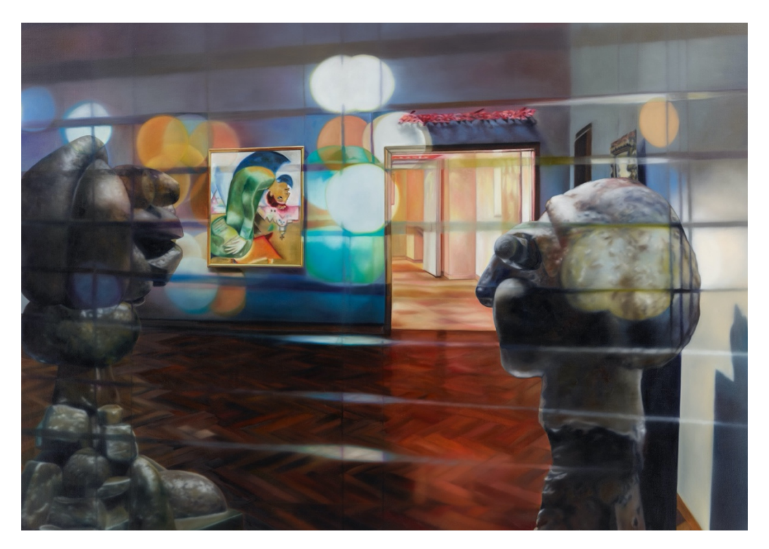
Figure 7: untitled (Marc Chagall, The Holy Coachman, 1911, Städel Museum Frankfurt a.M.), 2017/6, oil on canvas, 1,80 x 2,40 m, private collection.