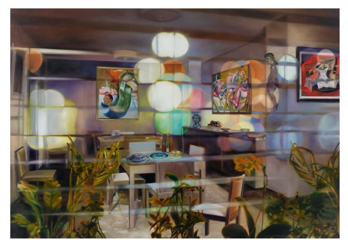
Figure 6: untitled (Haus Lange, Krefeld, dining room), 2017/5, oil on canvas, 1,80 x 2,40 m, private collection.