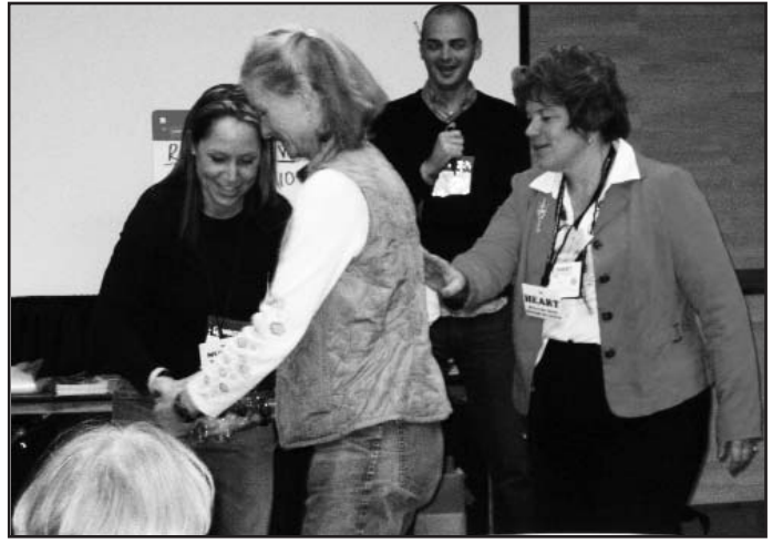
Teacher participants in the APS workshop modeled the circulation of blood and oxygen in the room by acting as a heart, lungs, muscles, or blood, and using marbles to quantify the amount of oxygen used or supplied.