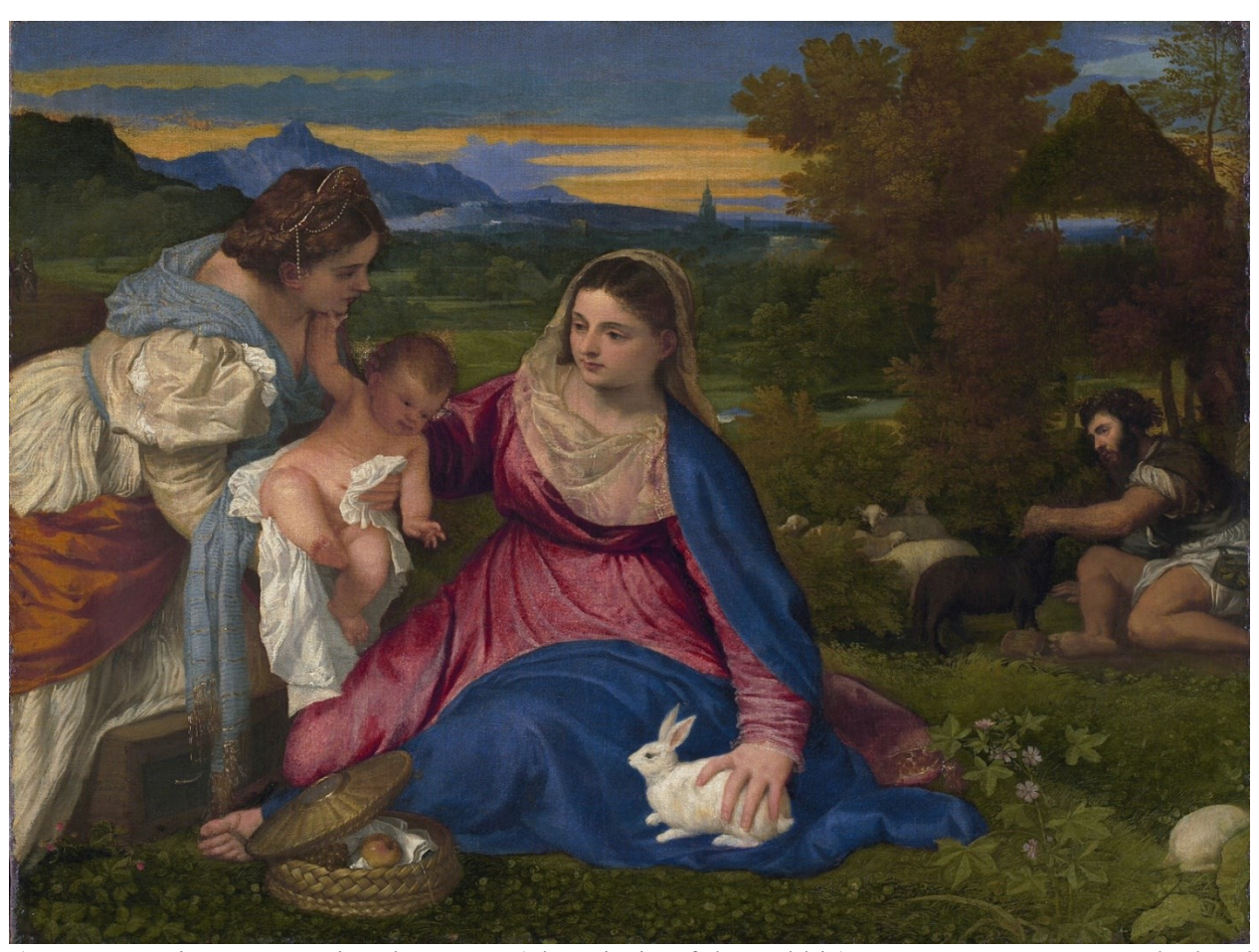
(Titian, La Vierge au Lapin à la Loupe (The Virgin of the Rabbit), 1530, Louvre, Paris. Idealized Italianate landscape background)