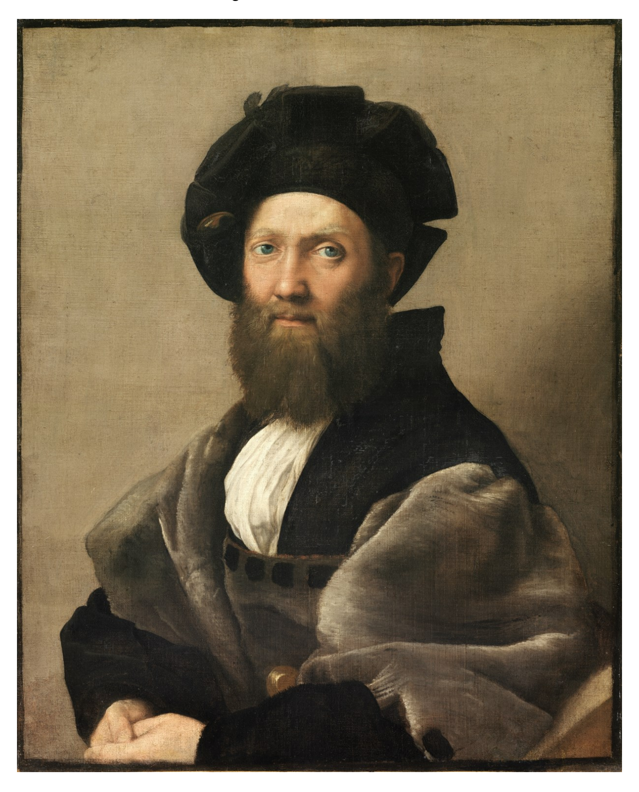
Denon wing - 1st floor - Grande Galerie - Room 8