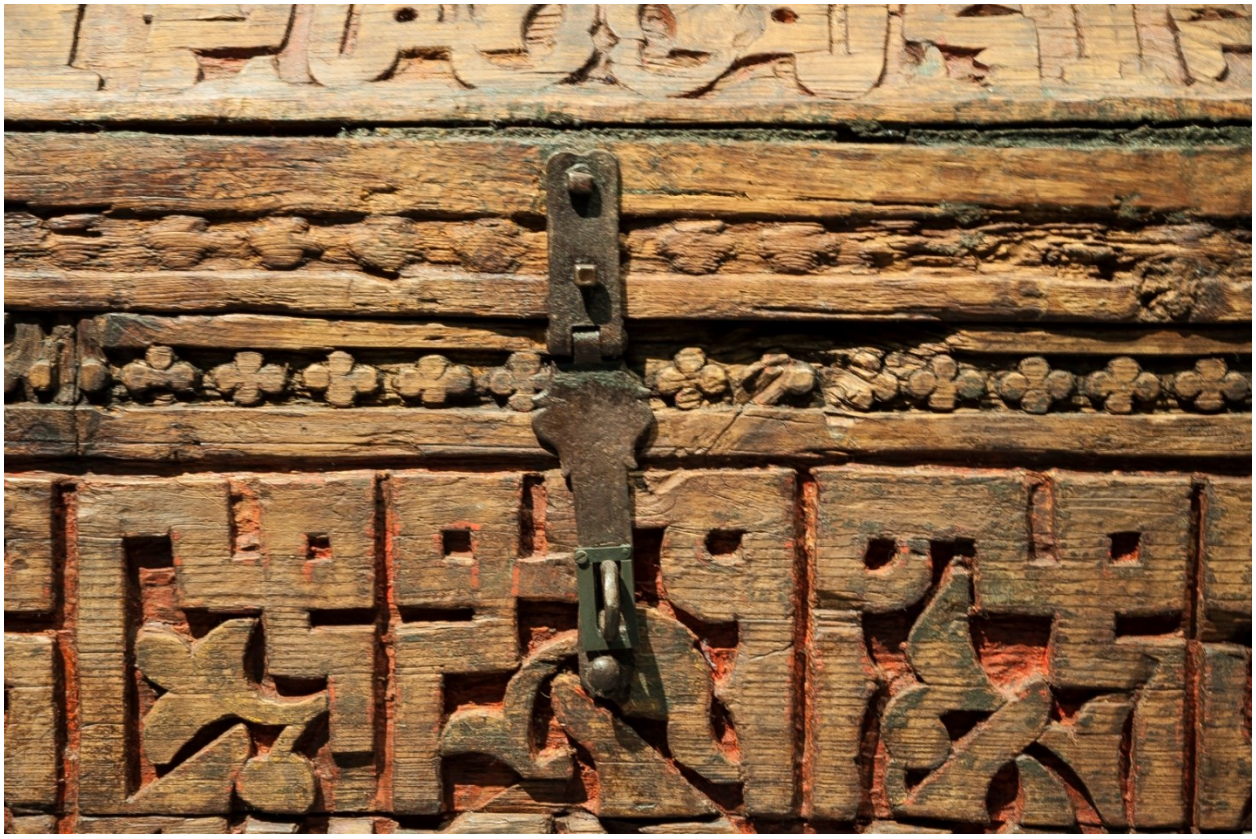
(Coffer, Fez, XIVth. Source: André ALLIOT, https://commons.wikimedia.org/wiki/File:Coffre-Fès 14 ème siècle. Louvre Paris.jpg, CC Attribution-Share Alike 3.0 Unported)

Louvre Museum includes various rich collections of works of art from different civilizations, cultures and eras. It includes about 460,000 pieces, without the deposits in other museums that remain on its inventories, and 554,498 with deposits, including about 225,000 graphic works (237,559 worksheets for albums, as of January 1, 2016) and 38,000 exhibited works. For reasons of conservation, it is impossible to show the drawings for more than three consecutive months. The rest of the collections are made up of secondary works or archaeological series.