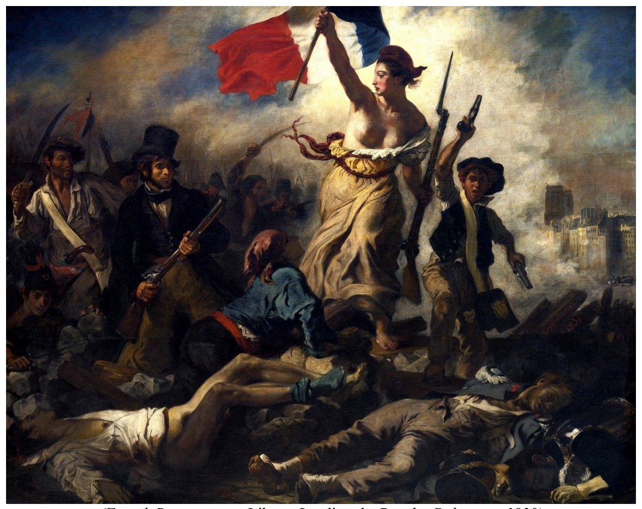
(French Romantic art, Liberty Leading the People, Delacroix, 1830)

Painting is a branch of plastic arts that represents a possible reality in two-dimensional artistic images created with the colors applied on a surface (cloth, paper, wood, glass, etc.). The goal is to get a composition with shapes, colors, textures and drawings that give birth to a work of art in accordance with aesthetic principles.