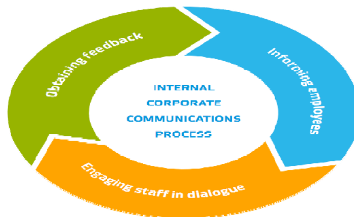
Figure no. 1 The internal corporate communications process

Communication makes possible the interaction between members of the working team. A manager should be the first to establish bridges between the members of the organization, through a careful and effective communication. Through communication, organization activities scroll correctly. A good manager will use communication in order to make it understandable to convey its message receptor exactly as we think in order to obtain the expected feedback at the time of the initiation of the communicative process. All these elements form the basis of communication processes, whereby individuals of an organization will be able to establish interpersonal connections, which are be the basis of good management activities, both internally and externally.