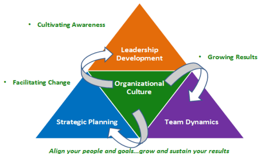
Figure no. 5 Organizational culture and communication

comfortably penetrate in the cultures where there is low confidence. In order for the members of the team to function, they must have fundamental skills in communication (the ability to understand thoroughly the others and being understood by them) and organization (ability to plan, act and do) and in resolving problems synergically (the ability to arrive at solutions that represent a third alternative). A manager can provide strategic direction and vision, can motivate and build a team based on mutual respect, which are complementary for each other, whether we are talking more about efficiency than performance, about direction and results than the methods, systems and procedures.