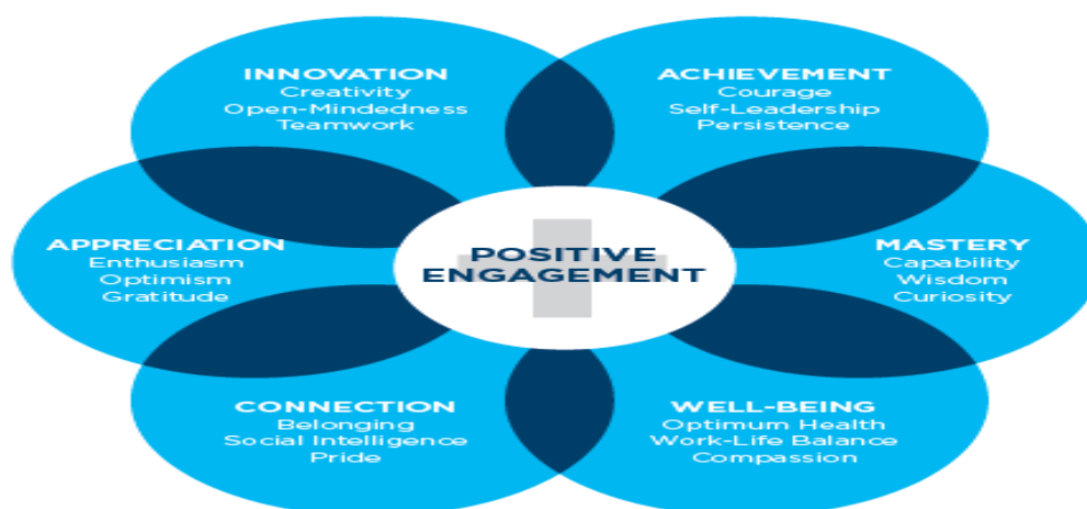
Figure no. 3 The positive engagement model (communication perspective)

As leader or manager in an organization, the person in charge needs to make him/her understood, and to send the information to arrive at the receiver in time, in order to be processed; if it is lost then the fault will occur at the organizational level. Effective communication involves expressing the content and intention of the transmitter to the receiver provided that the receiver may have understood the message and that between receiver and transmitter there are certain differences. It is pointless using the mind to dominate the heart. We act more on the basis of what we feel instead of based on what we think. If employees do not maintain harmonious feelings among them, emotional barriers will appear. Communication is primarily a matter of confidence and acceptance of ideas and feelings of others. If we manage to leave aside the spirit of adversity, social norms, exaggerated attention to building their own images, we save a lot of energy and time. A large part of the decision-making process in the organization requires working in teams. Driving groups allows the purchase of information, information that is required for efficient management.