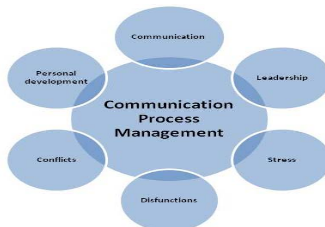
Figure no. 2 Communication Process Management (Source: Beattie, & Ellis, 2014)

Employees are the most important resource of the organization, and the way in which they are actively involved in attaining the strategic objectives of the company for which they work is crucial to get the expected performance of top management (Kandlousi et al. 2010).