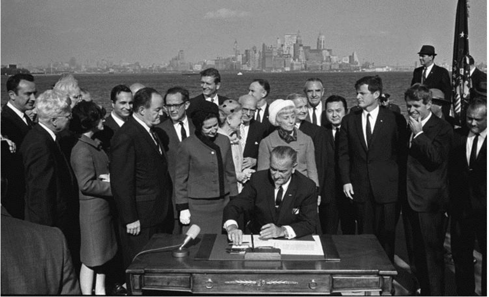
The saddest day in US history. President Johnson, with 2 Kennedy's and ex-President Hoover, gives America to Mexico -Oct 3rd 1965