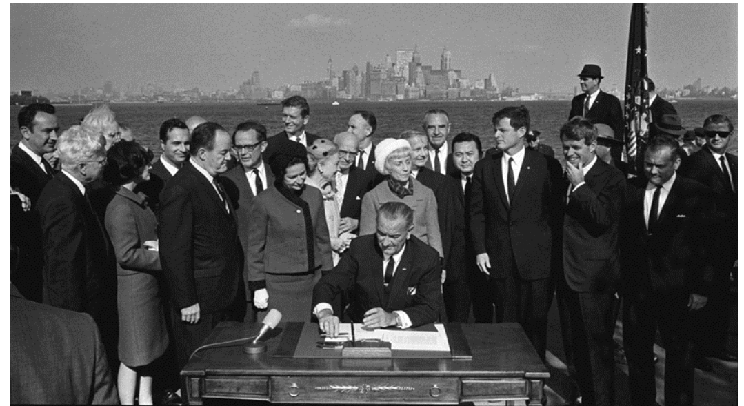
The saddest day in US history. President Johnson, with 2 Kennedy's and ex-President Hoover, gives America to Mexico - Oct 3rd 1965