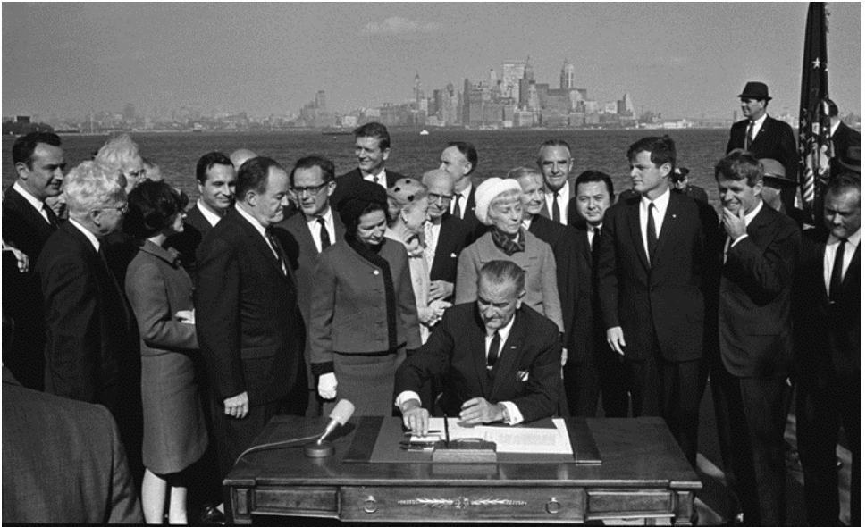
The saddest day in US history. President Johnson, with 2 Kennedy's and ex-President Hoover, gives America to Mexico - Oct 3rd 1965