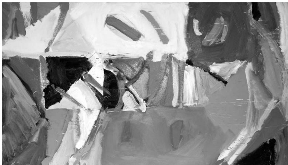
Taylor, C. (2003). Magma III (rotated). 40" x 72", oil on canvas.