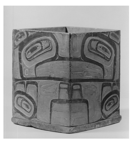
Figure 6. Household Box Representing Killer Whale (Taod), late 19th century, Northwest Coast, wood, pigment, 29.5 \times 25 cm, Brooklyn Museum, Creative Commons-BY (Photo: Brooklyn Museum).

Lévi-Strauss's (2006) interpretation of split representation probably comes closest to the Loosian position. As originally described by Boas (1927, 221–231) for Northwest Coast groups of North America, in split representation the subject of depiction is split and projected onto a flat surface so that the front view is represented as composed of two identical profiles (Figure 6). Split representation thus represents a sub-class of vertical bilateral symmetry. Lévi-Strauss understands split representation more broadly as a dislocation of a three-dimensional subject into elements that are put together again on a plane following arbitrary rules. He claims that the violence of disfiguring and then reconfiguring the subject of depiction in split representation visually represents – or visually negates (Lévi-Strauss 1961) – strict supernaturally sanctioned delimitations of human culture from nature, but also of various social stratifications within the human world. In short, split representation gives visual expression to a