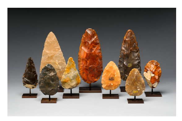
Figure 7. Nine Acheulean Bifaces, 700,000–200,000 BCE, France, flint, quartzite, Metropolitan Museum, CCo 1.0 Universal.

This suggestion has two major advantages. First, by recognizing those features that vary within an instrumental structure class as stylistic, it honors the intuition that instrumental structure analysis differs from stylistic analysis because it works on a different scale. Second, by associating universal non-conventional styles with instrumental structures, it steers clear of the serious problems plaguing non-instrumental explanations of