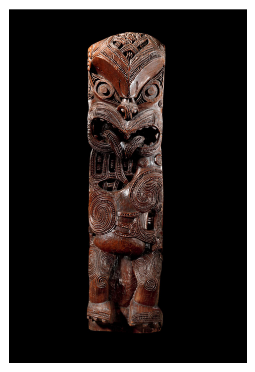
Figure 4. House Post Figure (Amo), c.1800, Maori people / Te Arawa, New Zealand, wood, 109.2 \times 27.9 \times 12.7 cm, Metropolitan Museum, CCo 1.0 Universal.