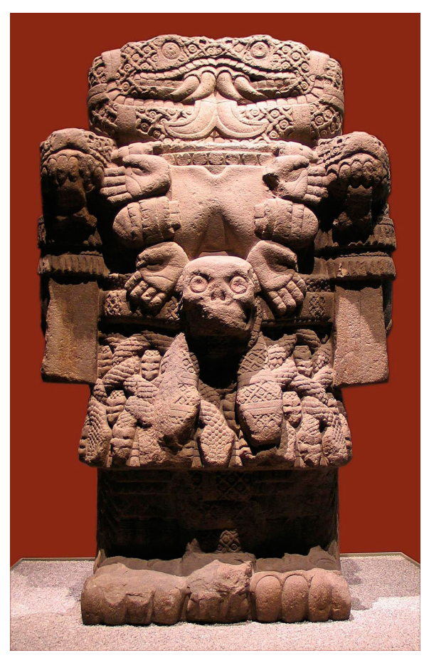
Figure 8. Coatlicue statue, 15th Century CE, Aztec, andesite, 2.52 m, Museo Nacional de Antropología, Mexico City. © Luidger, retrieved from https://commons.wikimedia.org/wiki/File:20041229-Coatlicue_(Museo_Nacional_de_Antropolog%C3%ADa)_MQ-3.jpg, Creative Commons BY-SA 3.0 (http://creativecommons.org/licenses/by-sa/3.0/).

those following vertical bilateral symmetry, have historically and globally opened the way for making images semantically charged beyond conveying resemblances. As opposed to mere tracing of outline shapes (as in Paleolithic cave paintings of animals), explicit planarity invites the schematization and hierarchical structuring of the figurative content as well as the conventionalization of meaning, such as when a pubic triangle of a Paleolithic Venus lends itself to be abstracted as a symbol of fertility (Summers 2003, 346–349). An explicitly planar ordering is also, according to Summers, equally suitable – and has been developed globally – to enhance the sense of authoritative, effective presence of the depicted subject. As each and every part of an explicitly planar image addresses a