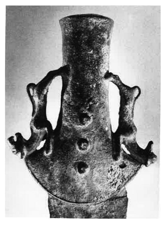
Figure 3. Hilt of a votive sword, c.1800 BCE, Diyarbakır, Turkey (reproduced from Seeher 2011, 114).

stylistic configuration as providing an independent access point into circumstances of production, circulation, and use. To regard similar inferences as legitimate modes of research is to assume that isolating principles of stylization may potentially contribute to social or historical knowledge wherever these principles obtain. In other words, it is to presume that stylistic analysis may provide original insight into the nature of a collective based on the presence of a style: The style is no more an explanandum, it is an explanans. This does not mean that stylistic analysis can 'substitute for history' (Sauerländer 1983, 267). It is a rare breed of a historian who would share the excessive optimism captured in the modernist architect Adolf Loos's claim that serves as this essay's motto. By contrast, the ambition is not to filter out everything one might know about the Hittites and rely purely on the Sword God's style to learn of its context. The claim would rather be that stylistic analysis may legitimately enrich our knowledge of the Sword God's context by providing access to information that is encoded in the style itself. The aim of this paper is to present the claim in as intellectually coherent a way as possible.