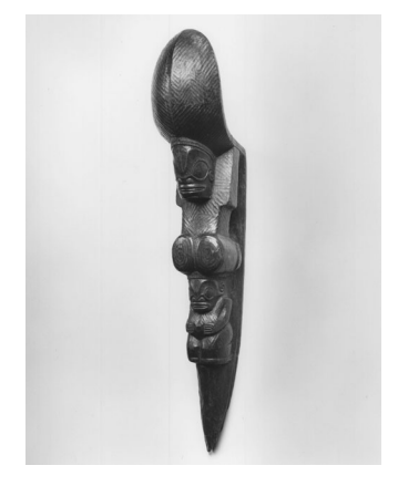
Figure 5. Stilt Step (Tapuvae), late 19th or early 20th century, Marquesan, wood, 36.2\times6.4\times10.8 cm, Brooklyn Museum, Creative Commons-BY (Photo: Brooklyn Museum).