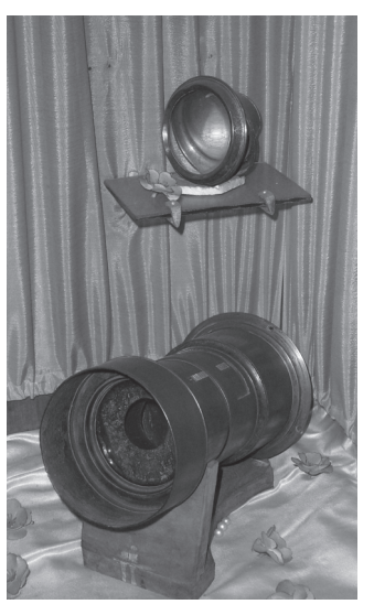
Main lens of the field camera used for taking the famous picture in which Sri Ramakrishna is seated

tained from the Municipal Corporation to facilitate its