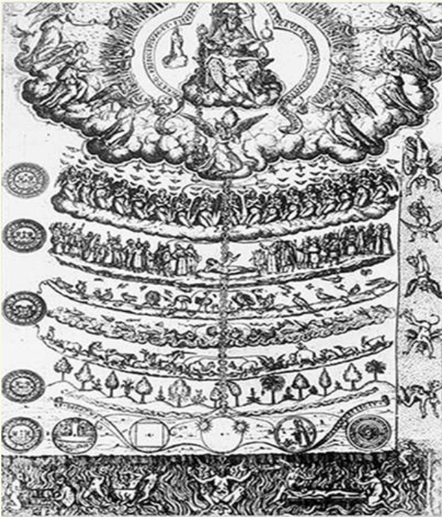
Fig 7 "The Great Chain of Beings"- Rethorica Christiana- 1579 AD