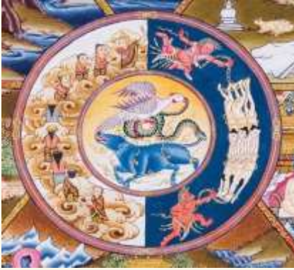
Fig 9 from others, the need to defend and protect the self arises, and these actions are typically based on aggression and desire. In the image of the Wheel of Life, the three animals at the hub bite each other's tails and chase one after the other. This continuous cycle of unawareness, aggression, and desire is the fuel that powers the wheel of cyclic existence.

Just as the pig (unawareness) is the source of the snake and rooster (aggression and desire), unawareness, often translated as ignorance, is the first link in the 12 links of interdependent origination. Non-recognition of our true nature and thus seeing oneself as separate and independent from others and phenomena sets cyclic existence in motion. As soon as we do not recognize our true nature, karmic seeds from countless previous lives begin ripening in the form of a unique psycho-physical system comprised of the five aggregates and the five elements. This takes place in links two through five. Once this mind-body system is