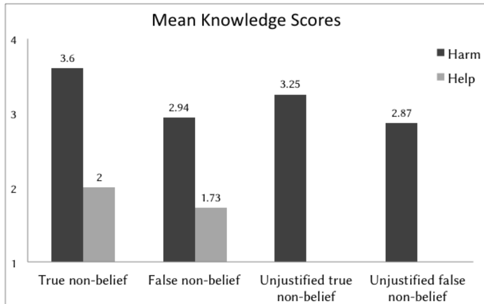
Figure 2: Experiments 2–4: Mean agreement with the knowledge ascription, on a 1 (strongly disagree) to 5 (strongly agree) scale. Experiment 2: true non-belief; Experiment 3: false non-belief; Experiment 4: unjustified true/false non-belief. No Help condition was included in Experiments 3 and 4.