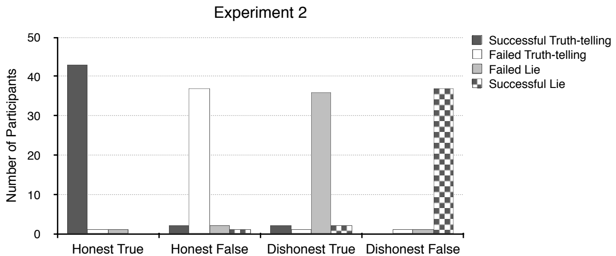
Fig. 2. Experiment 2. The number of participants choosing each option as best describing the protagonist.

that Jacob tried to tell the truth and succeeded. In Honest False, 88% of participants said that Jacob tried to tell the truth but failed. In Dishonest True, 88% of participants said that Jacob tried to tell a lie but failed. In Dishonest False, 95% of participants said that Jacob tried to lie and succeeded. In each case, the percentage of participants selecting the relevant option far exceeded what could be expected by chance, binomial tests, all ps < .001 .