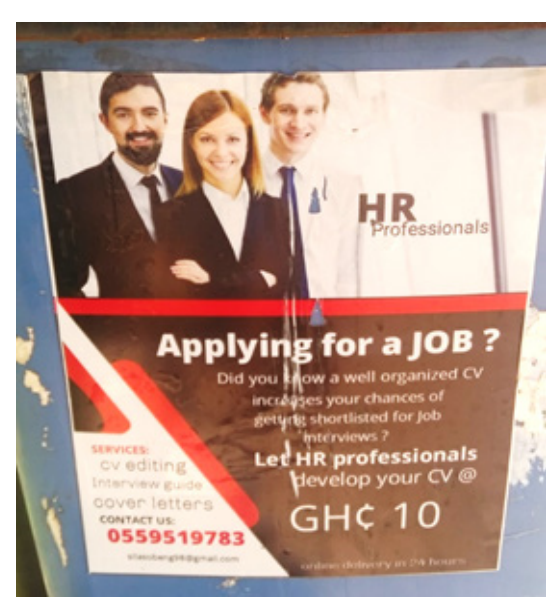
Fig 10. Billboard Sample 9

Sample 9 is a student-based online business. They offer services like how to write a professional CV, how to win an interview, how to apply for a job, and how to find a job of your choice.