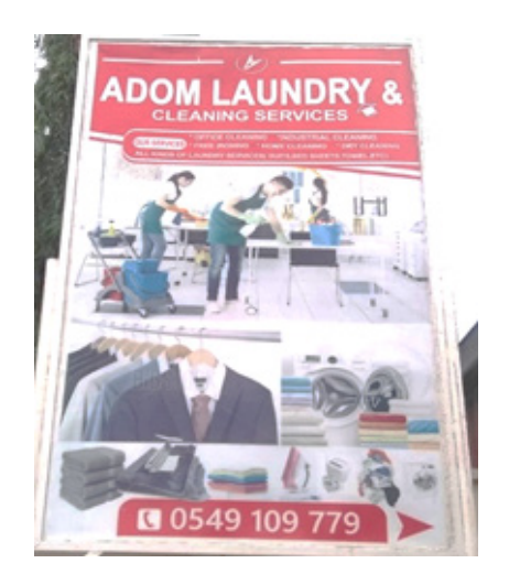
Fig 8. Billboard Sample 7

Sample 7 is a business that offers laundry and cleaning services. It has been operating for the past two years. This enterprise believes in billboard advertisement because it shows the public its location and the kind of services they offer.