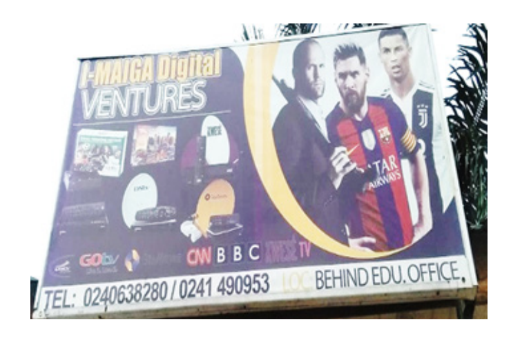
Fig 5. Billboard Sample 4

Sample 4 is a business that sells digital appliances. It has been in operation for two months. It believes that the use of billboard advertisement will attract customers, make the business sell faster, and it will tell the public about the location of the business.