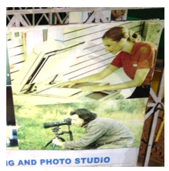
Fig 9. Billboard Sample 8