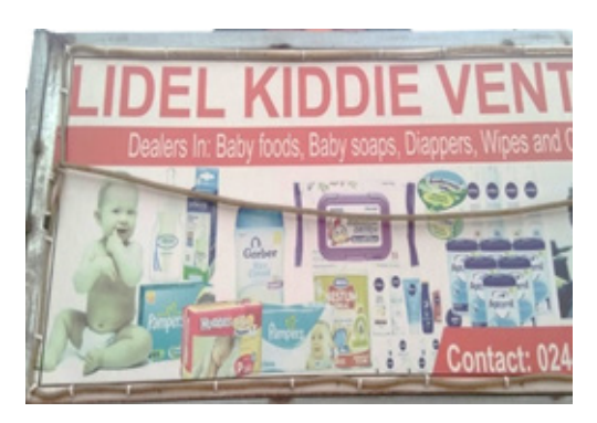
Fig 4. Billboard Sample 3

Sample 3 is a micro supermarket that sells different kinds of baby items. It has been in operation since 2019. It believes that billboard advertisements will tell people about the kinds of products they sell.