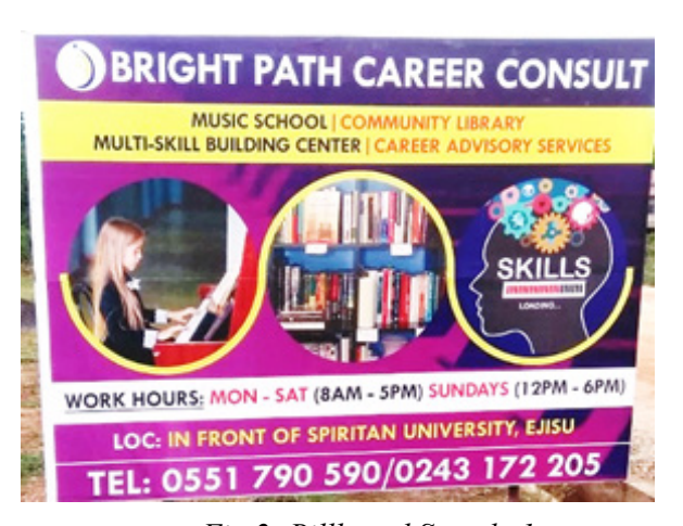
Fig 2: Billboard Sample 1