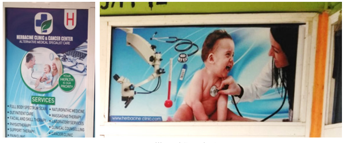
Fig 7. Billboard Sample 6

Sample 6 is also a medical centre. It has been in operation for four years. It believes in the use of billboard advertisements to tell the public about their hospital and the services they render.