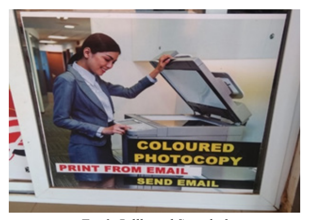
Fig 3. Billboard Sample 2

Billboard Sample 2 is a printing press. The business name was not allowed to be revealed. It has been in operation for two years. They use billboard advertisements to tell people about their work and the location of their business.