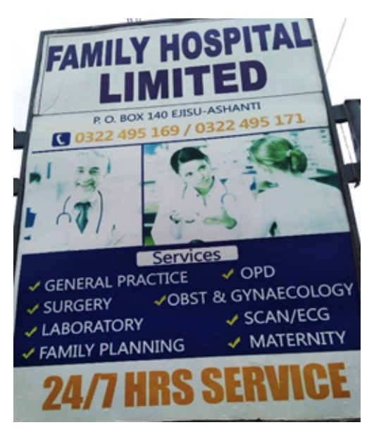
Fig 6. Billboard Sample 5

Sample 5 is a health care centre. It has been in operation for the past three years. According to the officials, billboard advertisement is an essential medium for informing the public about the work they do, and also to tell passers-by about the location of their health centre.