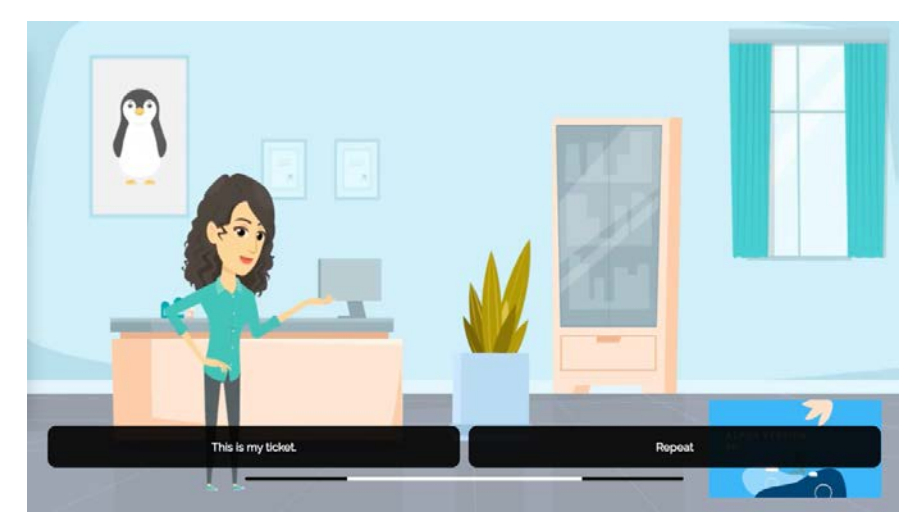
Figure 3. Game's interactive selection sample