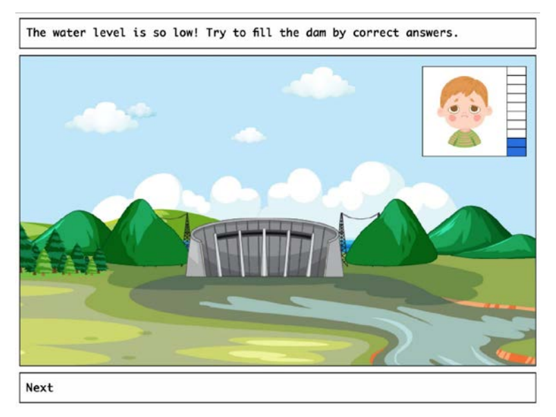
Figure 1. Effect of wrong answers on the environment in the game

effect. Hence, in this way, the player will try to remember the knowledge learned in the first part of the game, give the correct answers, and keep the water level high. The results will be shown visually to demonstrate the effect of water scarcity on the landscape by showing dry and green environments (Figure 1). Additionally, the players will not be shown the numbers but rather see the effect visually so that they will be able to visualize the conditions as much as possible. In the end, based on the reserved amount of water in the dam, the player will get rewards.