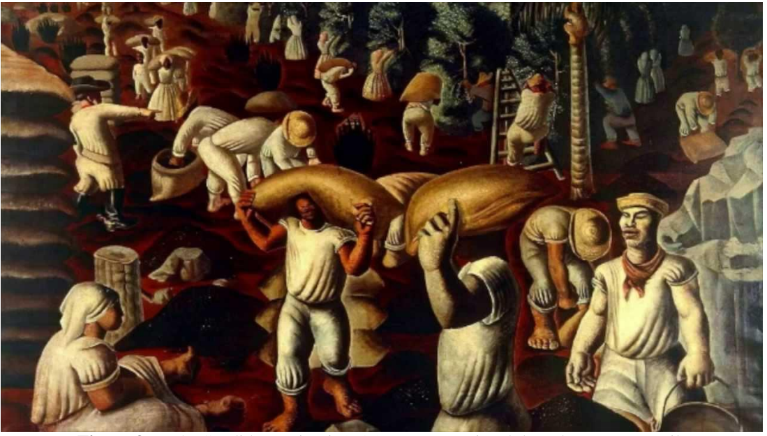
Figure 3: Café, Candido Portinari, 1935 (Museu Nacional de Belas Artes, Brazil)

They comprise childhood memories, very present in his artistic construction. The problem of man and reality are focal points in the Portinarian iconography. The landscape-scenario which hosts them is a redefinition of the space of a land lived, bound by lines and perspectives, characteristic of his memory of the trails in coffee plantations, in a hierarchy of planes and chromatic masses which reveal the cosmic force, the depth of the horizon, and the luminosity of the essence of life brought out by the theme of painting [14].