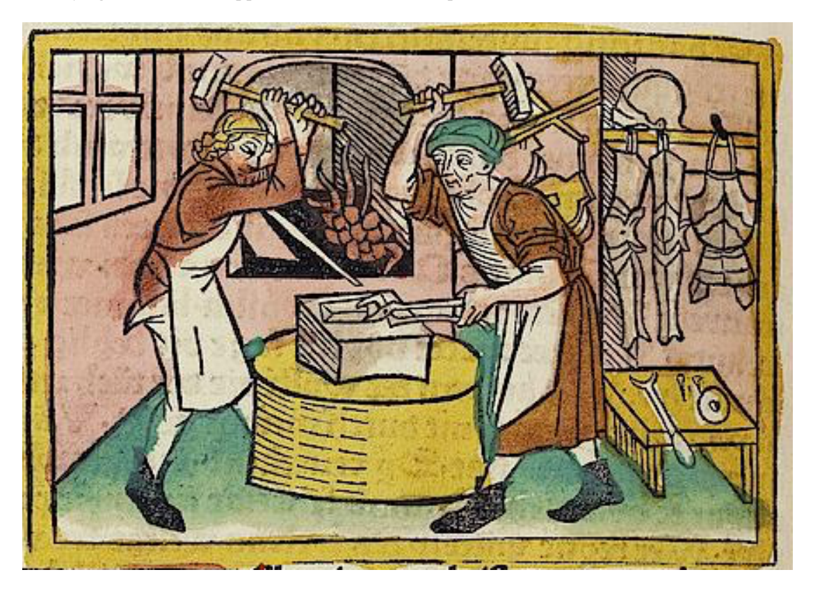
Fig 1: Artes armaturae. From Rodericus Zamorensis Spiegel des menschlichen lebens © Universitätsbibliothek Heidelberg [GW M38511, 60v]

specifies a bit further as, 'waffenschmid, goldschmid, kannttengiesser (...) muntzmeyster, steinmetz, maurer, zimmerleut, schreyner (...)'. A beautifully coloured illustration shows the blacksmith at work in his forge. The sixth craft is the 'fechten handwerck'. Rodericus adds, 'Theatrica, das is freudenspil genennet'. In his comment, he refers again to Aristotle, but paraphrases Hugh<sup>61</sup>: 'Dese kunst – Theatrica — is von den wort theatrum also genennet. Und theatrum ist die statt gewesen wohin sich das volk samnet die freudenspil zu sehen' (This art — theatrica — is derived from the word theatrum. And Theatre was the place where people met to see the joyful play)".<sup>62</sup> The illustration that follows could have come straight out of a fifteenth-century fight book. This supports the evidence Bauer put forward in his article.<sup>63</sup>