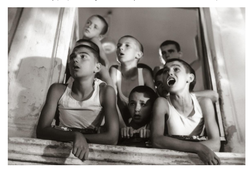
Fig. 8. The other orphans looking down from the windows soon after hearing gunfire: A previous snapshot of the same scene served as a poster to the film (Fig. 1). With one of the orphans shouting loud (right side of the figure) there is an obvious similarity of the famous picture "The scream" of Edvard Munch

A Holy Mass re-enactment is configured inside the convict of the orphanage, soon after the killing of the orphan and the arrest of the guardian. The superior of the institution enters the facility accompanied in a straight line from the questor and other persons. The entrance and the characters' gait (here in the left inset of the following snapshot) imitates priest accompanied from deacons and laypersons while entering a church at the beginning of the liturgical service. Even more, the hand signs they make to orphans inviting them to sit down, once reaching a cathedral position as in an improvised altar (right inset of the last figure), re-evokes again the repetitive and disguised religious symbolic, embedded inside the plot.