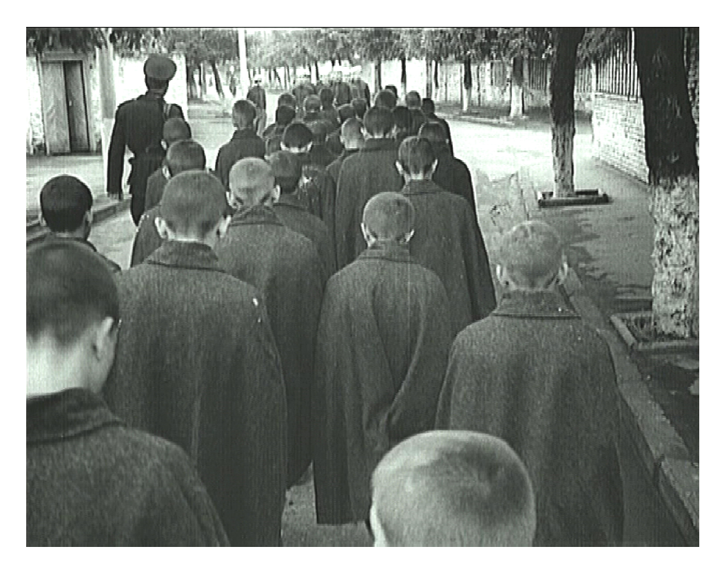
Fig. 2. Orphans turning back to the dormitory after a sleepless night, accompanied from a soldier, and eventually encountering a group of fascist youngsters coming from the opposite direction (white hats, upper center of the snapshot)

[Snapshot from 'Red poppies on the wall']