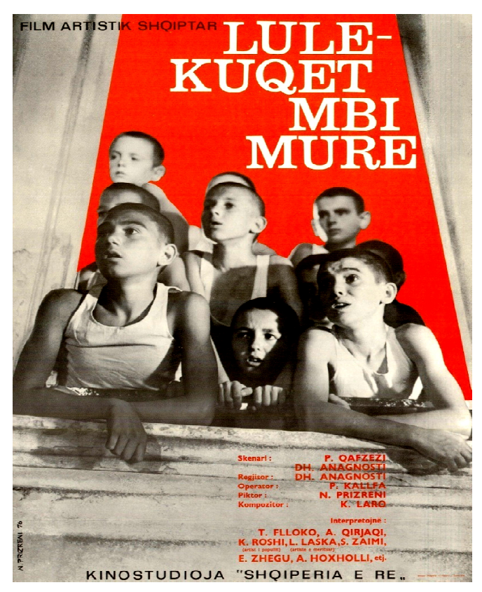
Fig. 1. Poster of the movie "Lulëkuqet mbi mure" (Albanian for 'Red poppies on the wall') [Available also online at: https://www.imdb.com/title/tt0170178/?ref_=nm_flmg_dr_9. Last accessed August 21<sup>st</sup>, 2020]

Fig. 2 is a photo from the start of the movie, between the 6<sup>th</sup> and 8<sup>th</sup> minute after its beginning (the entire movie lasts 1 h 40 minutes). Orphans were forced to wake up in the midnight, when the Italian superior and the guardian of the facility entered brutally in the dormitory and started yelling. All teenagers were forced to run out in the streets of the city, under police control, trying to wipe out revolutionary slogans that communists or antifascists had painted in the city walls. The night was cold and sleepless, and the following morning all teenagers were confusedly returning to the orphanage, as in a grim pilgrimage.