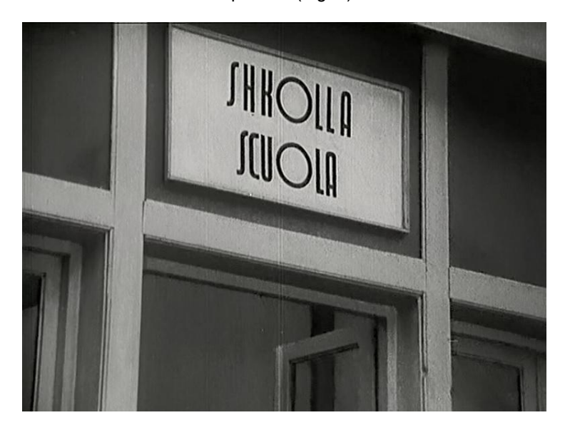
Fig. 3. The sign denoting the entrance to the school, both in Albanian (upper part) and Italian (below): the "o" is deliberately deformed [Snapshot from 'Red poppies on the wall']

stances while alluding widely to the crucifixion, as we'll show below. A pietà stance would have been totally unacceptable to the heroic imagery of the official ideology: Communists could never bow their head and look for mercy. Instead, once again through playing under the cover of a secular (if not atheist) film director, he opts for depicting the children of the orphanage as angels (Fig. 5).