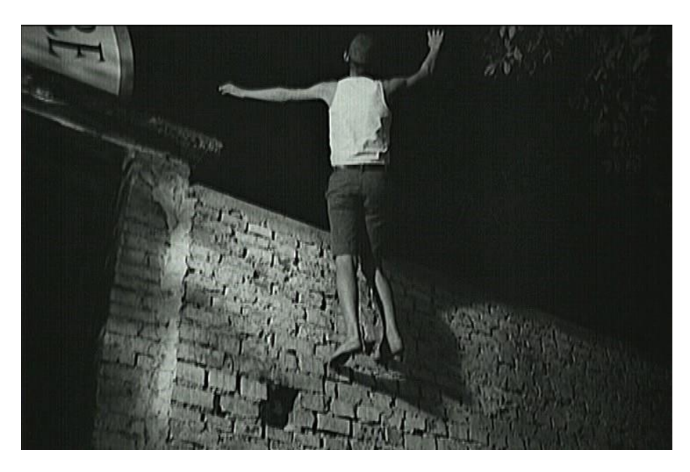
Fig. 6. The runaway orphan was caught while climbing the wall of the facility, and shot down from the fascist patrol, in a crucifixion stand

[Snapshot from 'Red poppies on the wall']