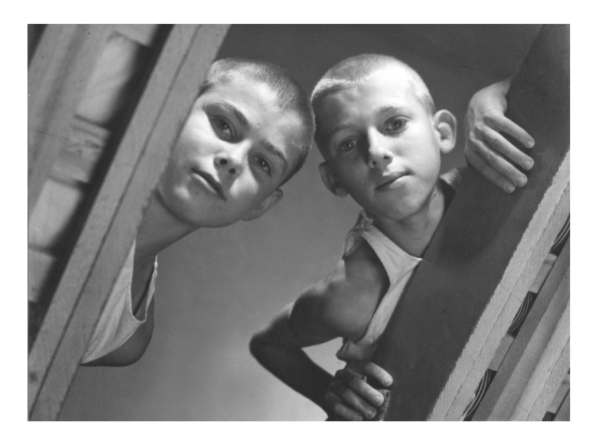
Fig. 5. Snapshot from the dormitory. The picture of two orphans staring down is just one of the disguised Christian imageries embedded in the narrative

[Snapshot from 'Red poppies on the wall']