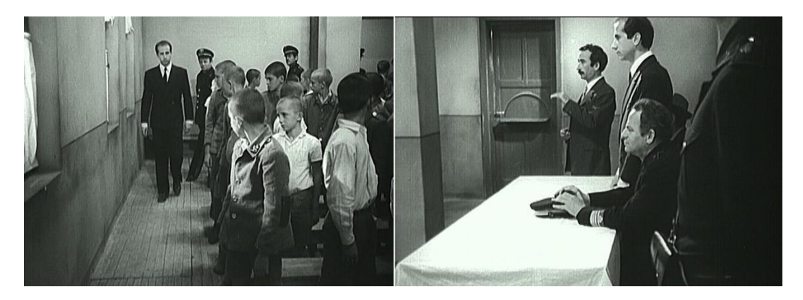
Fig. 9. After forging the medical expertise, the school superior and his accomplices try to sell their version to the kids: It was an accidental falling, not a shooting. They enter the room as in a procession (left inset) and invite orphans to sit down (right inset) as during the beginning of an eucharistic service. Gait, lighting and gestures all together serve to this strange manipulation of the environment

[Both insets from 'Red poppies on the wall']