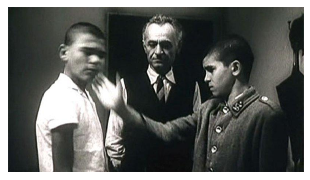
Fig. 4. Orphans slapping each other in the face, under direct orders of a sadist guardian (center of the image)

[Snapshot from 'Red poppies on the wall']