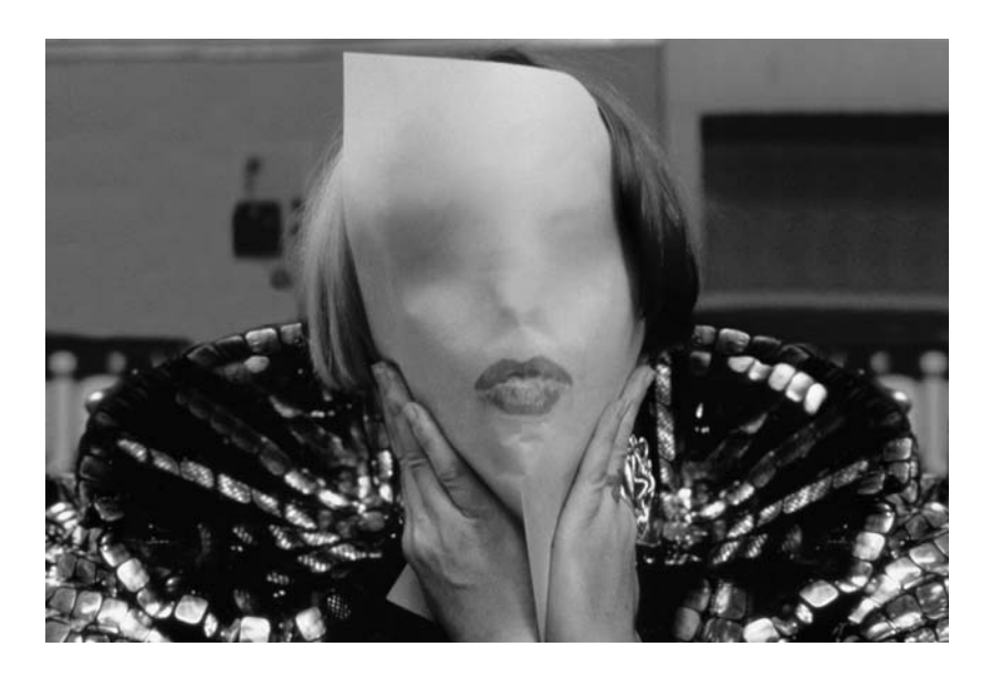
Figure 16.4. ORLAN, The Reincarnation of Saint ORLAN or Pictures New Pictures series, Kiss on Tracing Paper, The Fourth Surgery-Performance Titled Successful Operation, 1991. Photograph, 165 × 110 cm. © ORLAN.

Three significant critics currently invoke either Joanna Frueh's monster/beauty or Sigmund Freud's theory of the terrifying castrated woman as their inspiration for misinterpreting ORLAN as monstrous.