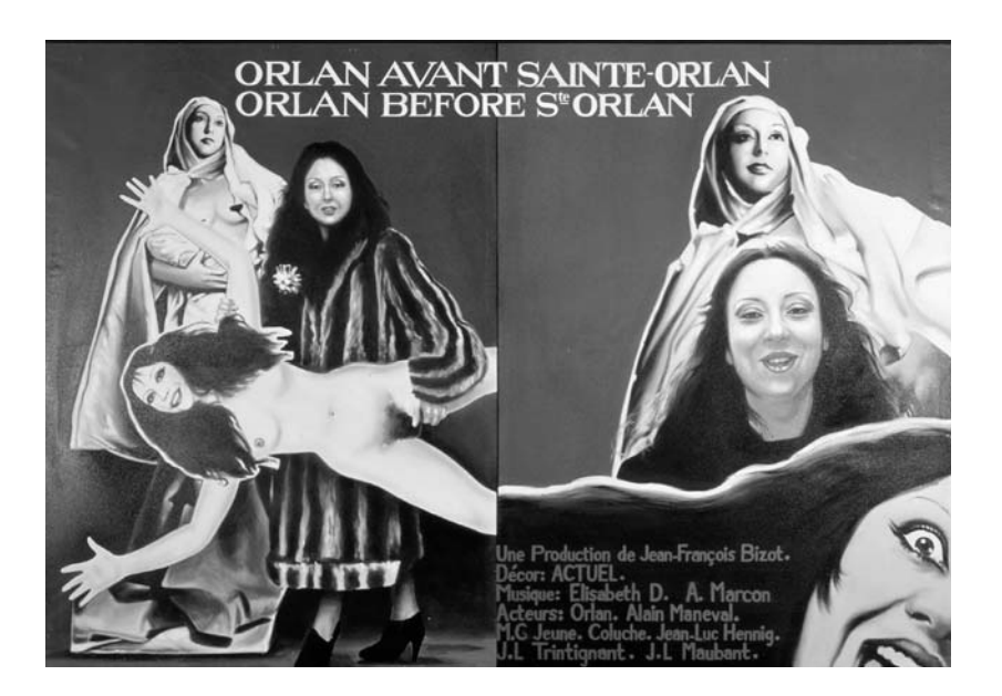
Figure 16.5. ORLAN, Painted Posters series, Imaginery crédits for ORLAN before Saint ORLAN , 1988. Acrylic on stretched canvas, painted by Publidécor, 300 × 200 cm.

Indeed, it can be said that ORLAN's reincarnation gives birth to a type of shemonster. She has explicitly compared her artistic aim with the creation of a monster; and even had herself photographed as the Bride of Frankenstein in 1990. The difference between the two "monsters" is that she is the creator as well as the final product: the sacré monstre. 66