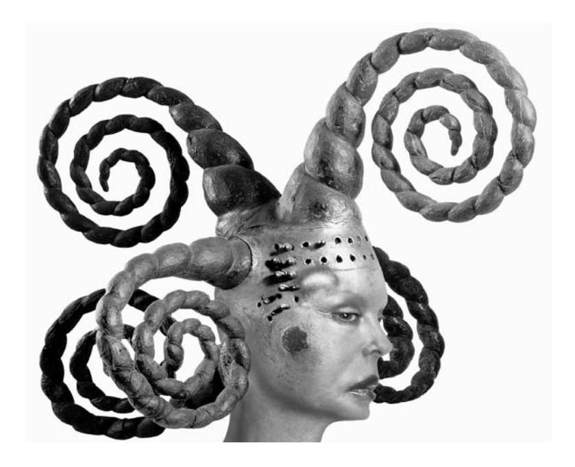
Figure 16.3. ORLAN, Refiguration, African Self-Hybridization series, Ancient Crest of Ejagham Nigeria Dance and Face of Euro-Saint-Etienne Woman, 2000. Digital photograph, 124 × 155.5 cm. © ORLAN.

The next phase in Self-Hybridizations is a series of photos inspired by African natives, photographed as if being discovered for the first time in the nineteenth century by a probing explorer with a new camera (most are in black and white). Consider the image entitled Ancient Crest of Ejagham Nigeria Dance and Face of Euro-Saint-Etienne Woman (2000; fig. 16.3). Also included in the African series is a life-size sculpture of a human body (ORLAN's) scarified in decorative patterns. As described by one sympathetic critic, Serge Gruzinski, the photographic images exemplify the "still relatively little explored—and therefore relatively unfamiliar" phenomenon of mélange: "Mixing, mingling, blending, cross-breeding, combining, superimposing, juxtaposing, interposing, imbricating, fusing and merging are all terms associated with the mestizo process, swamping vague descriptions and fuzzy thinking in a profusion of terms." Considered as a manifestation of