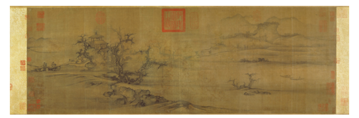
Figure 1: Guo Xi, Old Trees, Level Distance, ca. 1080. Handscroll, ink and colour on silk, 35.6 x 104.4 cm. Gift to the Metropolitan Museum of Art, New York, by John M. Crawford Jr. in honor of Douglas Dillon, 1981.

oriented towards fixed ideals and absolutes, Chinese traditional painting attempts to emphasise the vitality of nature, vagueness, and change [14, 21, 43]. When Western art emphasised the genius author as a mediator to an understanding of the world, Chinese art de-emphasised the presence of the author as mediator. Instead, it stressed the function of the artwork as an interface between the viewer and the world [14]. In The Lofty Message of Forest and Streams Guo Xi further states: